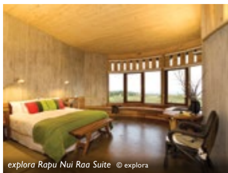
explora Rapa Nui Raa Suite

Morning at leisure before your flight (not included). Tour ends. B