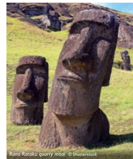
Rano Raraku quarry moai

★★★★★ Located a short drive from Hanga Roa with sweeping views of the shoreline, this hotels architecture is inspired by traditional motifs. It has 16 airy, inviting guest rooms, a restaurant, bar and swimming pool.