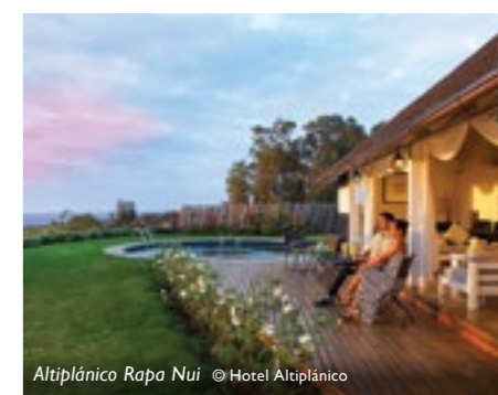
Altiplánico Rapa Nui

★★★ Designed to reflect the natural textures of Easter Island's volcanic landscape, this stone-and-timber hotel has 13 rooms with direct access to the pool, gardens, a bar, restaurant and free Wi-Fi.