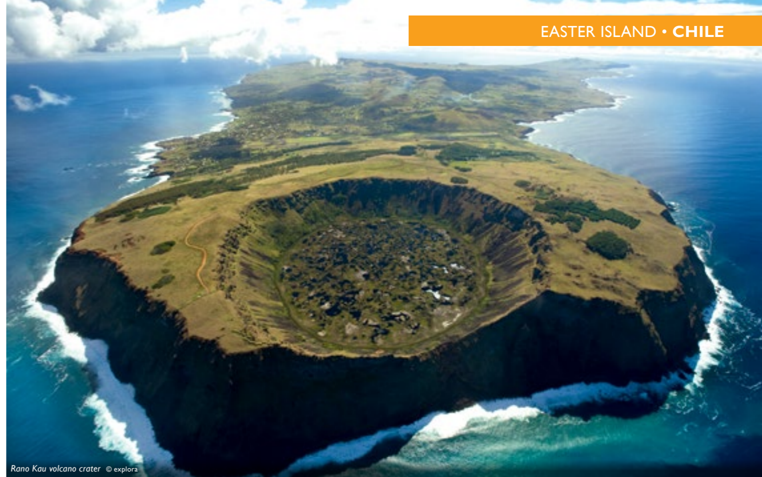
Rano Kau volcano crater