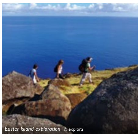
Easter Island exploration