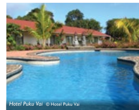
Hotel Puku Vai

★★★★★ Blending into its surrounding environment the hotel has stunning panoramic ocean views. Situated on the main promenade of the town it offers 75 serene rooms and suites, two restaurants, bar, swimming pool and professional day spa.