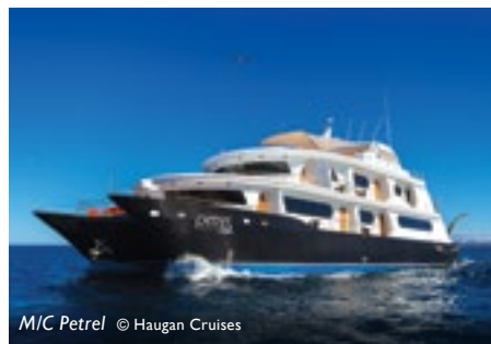
M/C Petrel