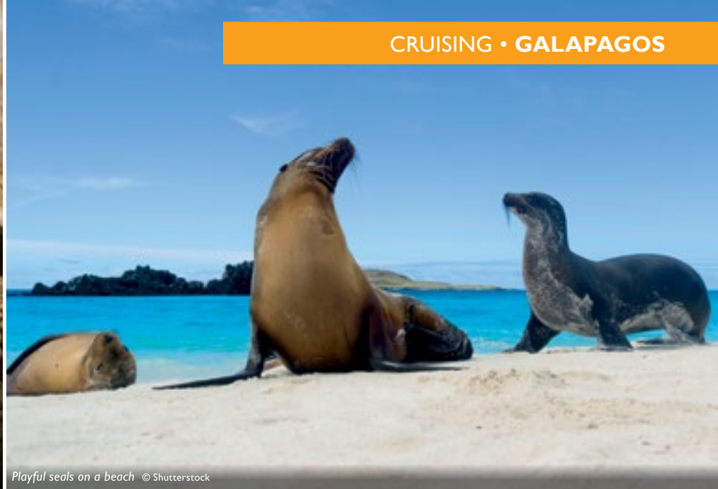
Playful seals on a beach