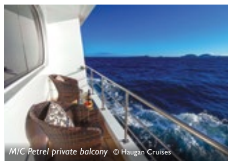
M/C Petrel private balcony