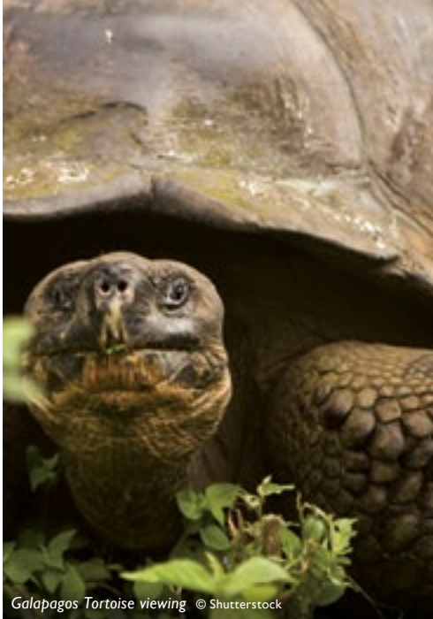
Galapagos Tortoise viewing