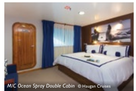
M/C Ocean Spray Double Cabin