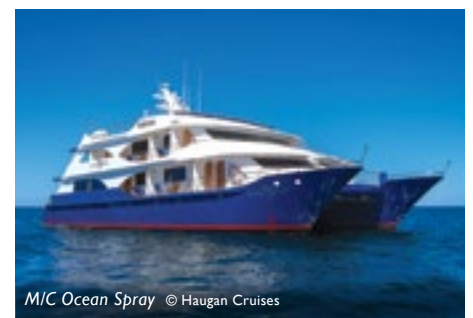
M/C Ocean Spray