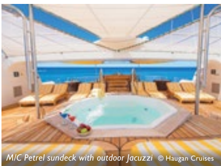
M/C Petrel sundeck with outdoor Jacuzzi

Flights, alcoholic drinks and gratuities.