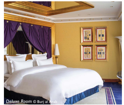
Deluxe Room