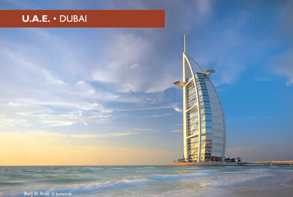
Burj Al Arab