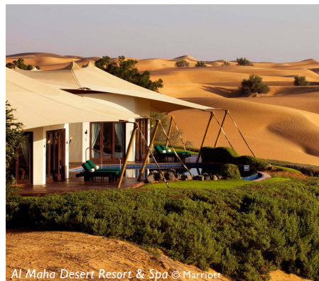
Al Maha Desert Resort & Spa