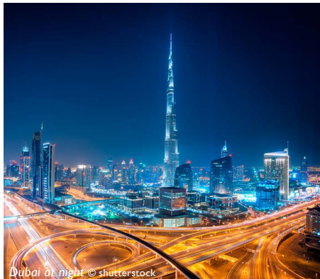
Dubai at night

D ubai is a heady mix of old and new, with traditional buildings standing alongside gleaming skyscrapers. With a multitude of ancient souks and shiny malls, the city is a heaven for shoppers and is known for its fine dining.