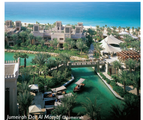
Jumeirah Dar Al Masyaf

This luxury desert resort is nestled among the lush palm groves and iconic sand dunes of the Dubai Desert Conservation Reserve. The resort has 42 authentic suites, each with a private plunge pool and offers secluded tranquility. Amenities include a restaurant serving both traditional Arabic and international cuisine, spa and fitness studio.