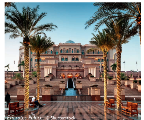
Emirates Palace

Rising up from the dunes of the largest sand desert in the world, the Empty Quarter, the 206 room resort is an oasis paradise. Boasting 6 restaurants, this unique resort is all about experiences, and offers private desert dining experiences, villa BBQ's and a host of activities including archery, desert biking, sledding and desert safaris.