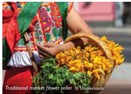
Traditional market flower seller