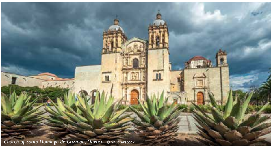
Church of Santo Domingo de Guzman, Oaxaca