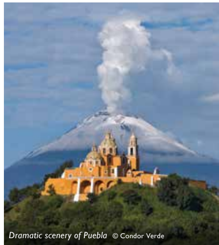
Dramatic scenery of Puebla