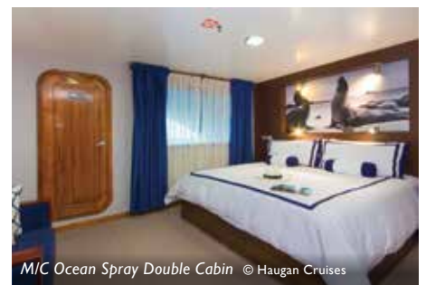
M/C Ocean Spray Double Cabin