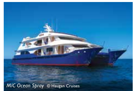
M/C Ocean Spray