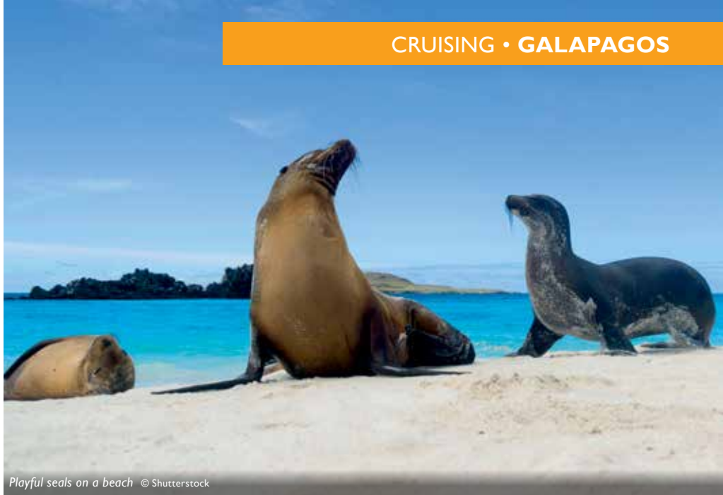
Playful seals on a beach