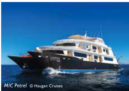
M/C Petrel