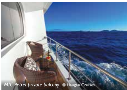
M/C Petrel private balcony