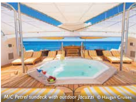
M/C Petrel sundeck with outdoor Jacuzzi

Flights, alcoholic drinks and gratuities.