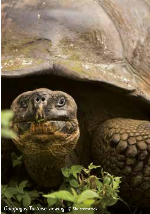
Galapagos Tortoise viewing