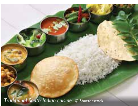
Traditional South Indian cuisine