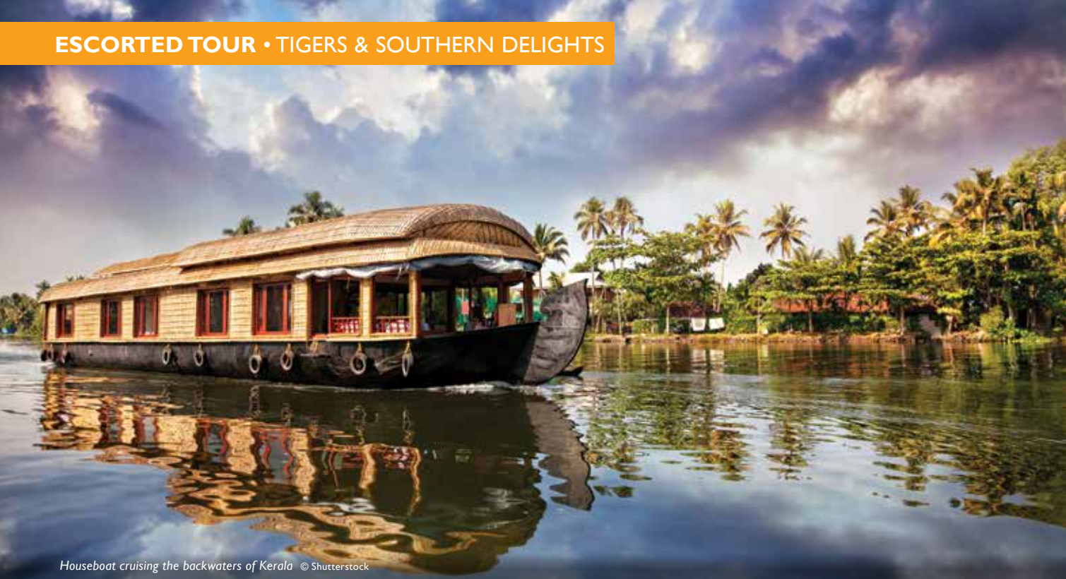
Houseboat cruising the backwaters of Kerala