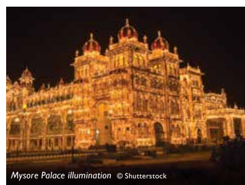
Mysore Palace illumination