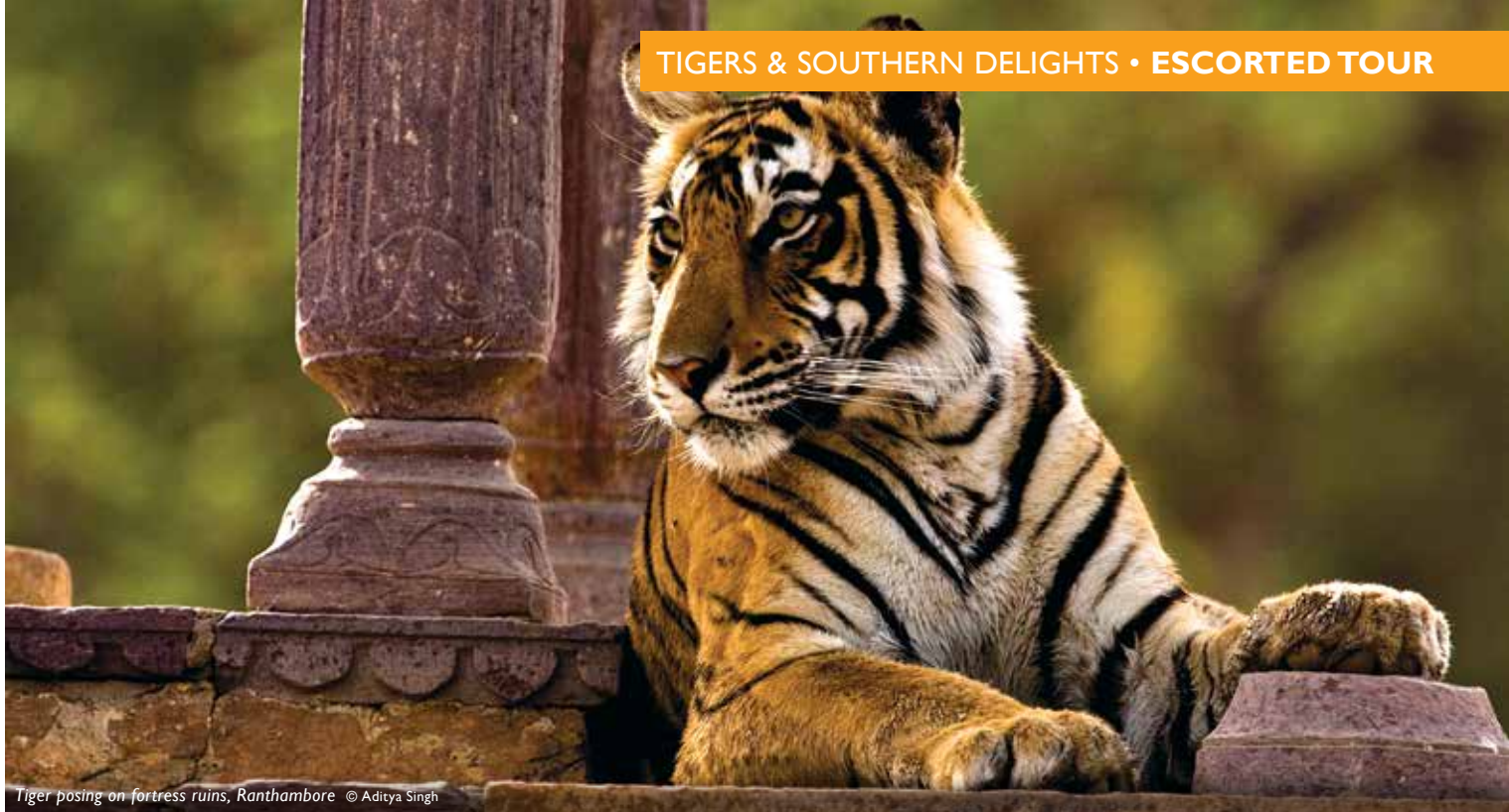
Tiger posing on fortress ruins, Ranthambore