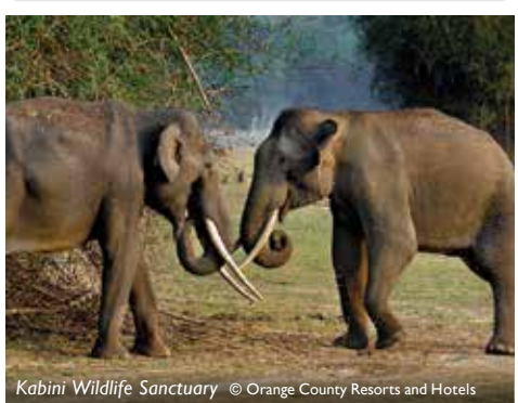
Kabini Wildlife Sanctuary