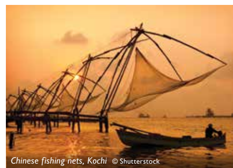
Chinese fishing nets, Kochi