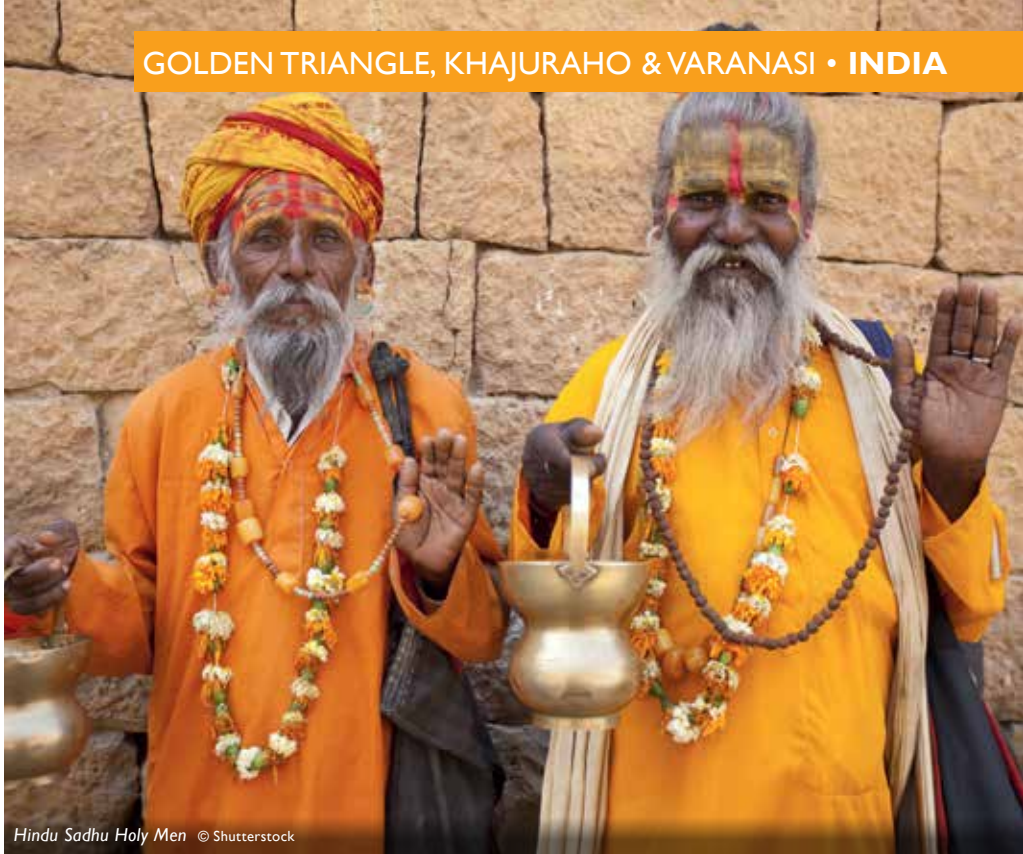
Hindu Sadhu Holy Men