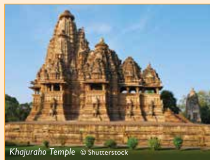
Khajuraho Temple