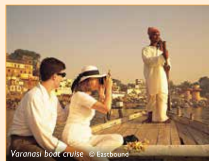
Varanasi boat cruise