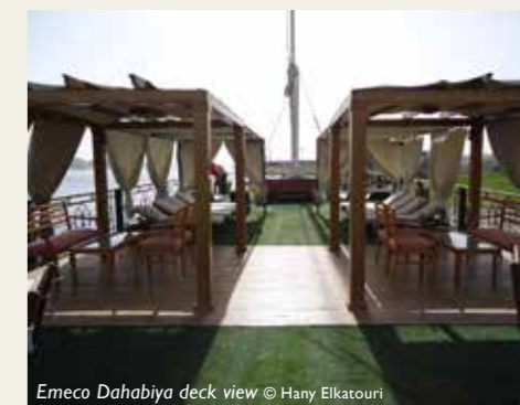
Emeco Dahabiya deck view

Emeco have three dahabiyas in their fleet: the Princess Grace, the Dalida and the Merit, all decorated in both traditional and contemporary style. The Princess Grace and the Dalida each offer 8 spacious ensuite cabins with large windows, whilst the Merit has 10 deluxe cabins. All dahabiyas have a large indoor lounge, dining and bar area, whilst the spacious sundeck has a shaded lounge and dining area, bar, sunbeds and Jacuzzi. Explore the sights with an English speaking guide.