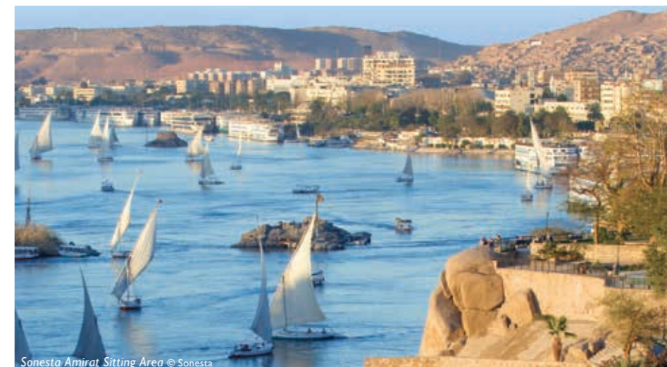
Sonesta Amirat Sitting Area