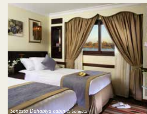
Sonesta Dahabiya cabin

Sonesta's boutique sailing boat, the Amirat, offers a unique cruise experience reminiscent of early 20th century exploration. Combining beauty and comfort, the vessel takes just 14 guests and there is an almost equal number of staff to make your stay more enjoyable. The dahabiya includes 5 deluxe cabins and 2 elegant suites with a private terrace. The Amirat features a beautiful lounge, dining room, spacious sundeck and open air Jacuzzi.