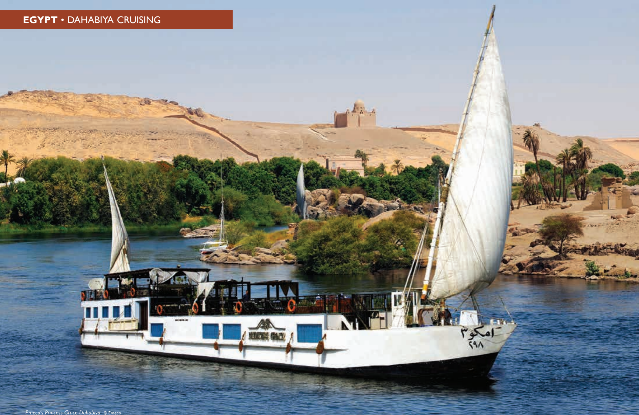
Emeco's Princess Grace Dahabiya