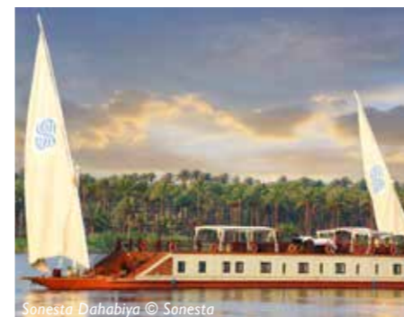
Sonesta Dahabiya