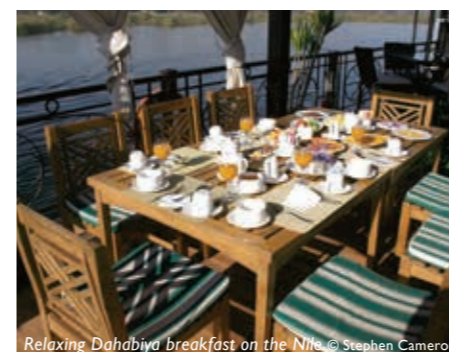
Relaxing Dahabiya breakfast on the Nile