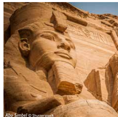
Abu Simbel

Note: Tours also operate in reverse. 7 night cruises are also available.