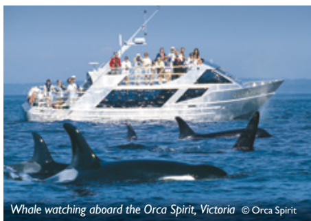
Whale watching aboard the Orca Spirit, Victoria