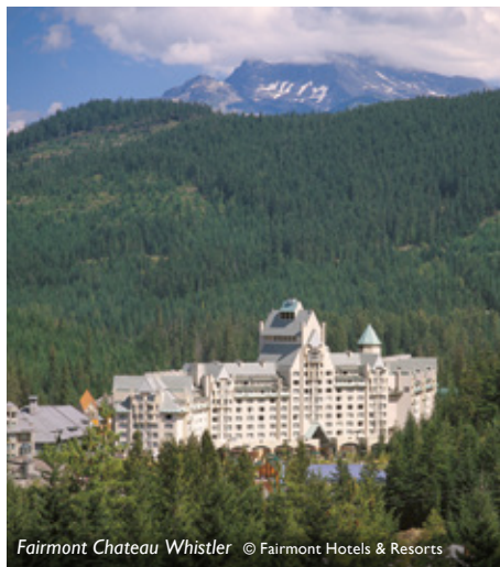
Fairmont Chateau Whistler

Departure transfer to downtown Vancouver.