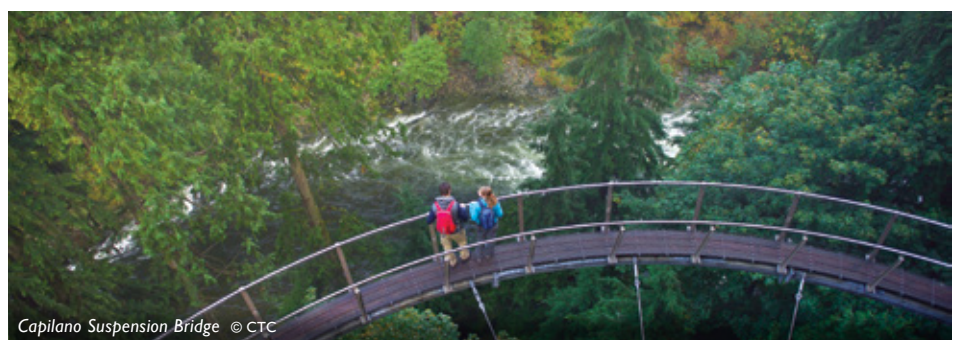
Capilano Suspension Bridge

Located on trendy Robson Street, this all-suite hotel offers 217 comfortable one and two-bedroom apartments complete with galley kitchens so you can feel right at home. Enjoy the convenience of an onsite restaurant, indoor lap pool, sauna, hot tub and terrace garden.