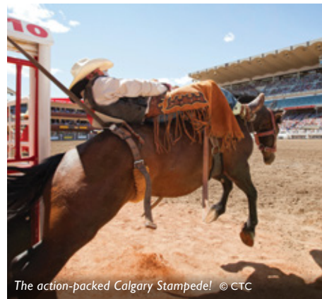
The action-packed Calgary Stampede!