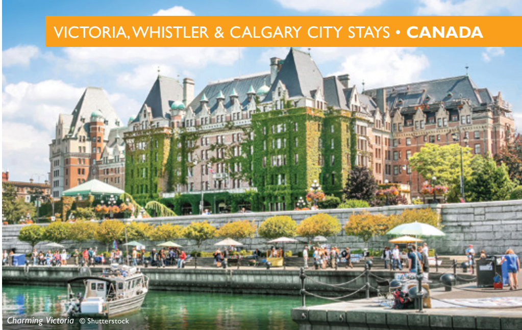
Charming Victoria