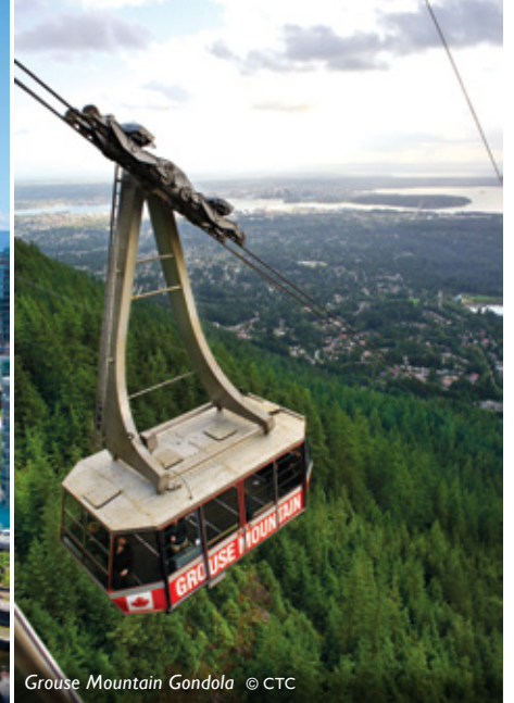
Grouse Mountain Gondola