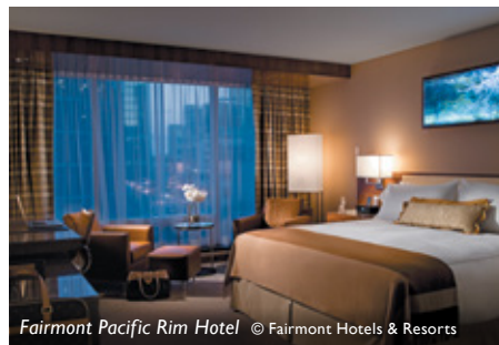
Fairmont Pacific Rim Hotel

Further details for all tours on request.