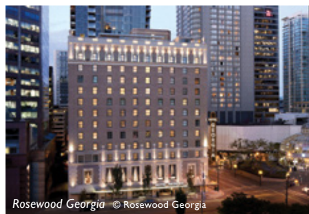
Rosewood Georgia

This modern hotel offers breathtaking views of Vancouver's Harbour, mountains and city skyline and is situated beside the Canada Place Cruise Ship Terminal. It features 489 contemporary rooms, an outdoor pool overlooking the harbour, a restaurant, cafe, bar, rooftop garden and gym.