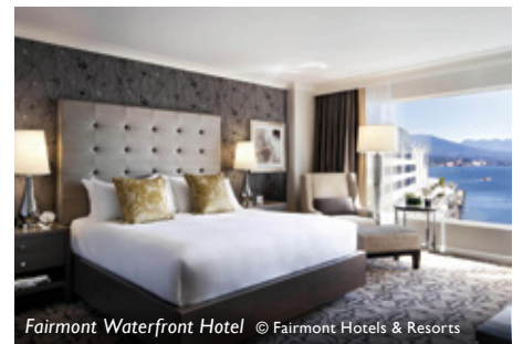
Fairmont Waterfront Hotel

Offering sweeping views of the surrounding mountains and harbour, the prestigious Fairmont Pacific Rim Hotel has prime access to Vancouver's cruise ship terminal and the city's best shopping and dining areas. The 367 elegant guest rooms and suites feature Italian linens and marble bathrooms.