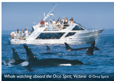
Whale watching aboard the Orca Spirit, Victoria