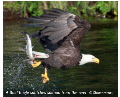
A Bald Eagle snatches salmon from the river