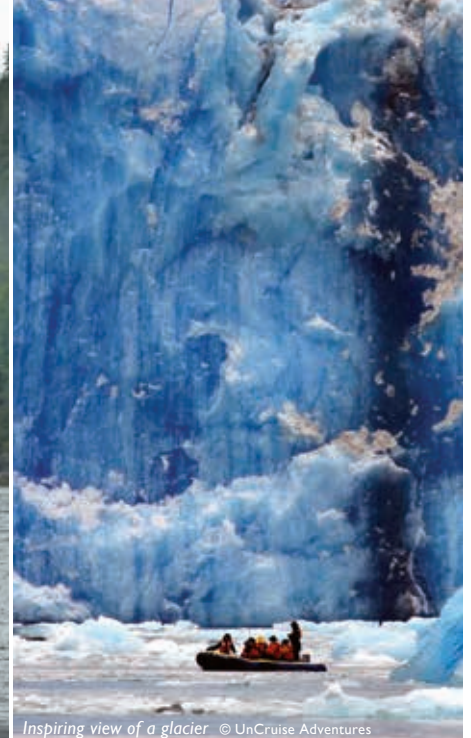
Inspiring view of a glacier