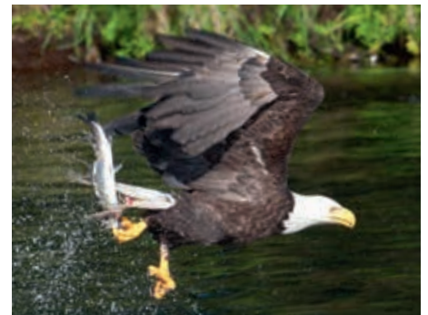
A Bald Eagle snatches salmon from the river