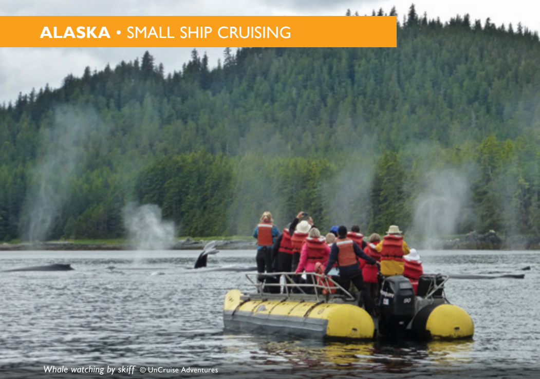
Whale watching by skiff