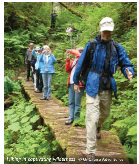
Hiking in captivating wilderness