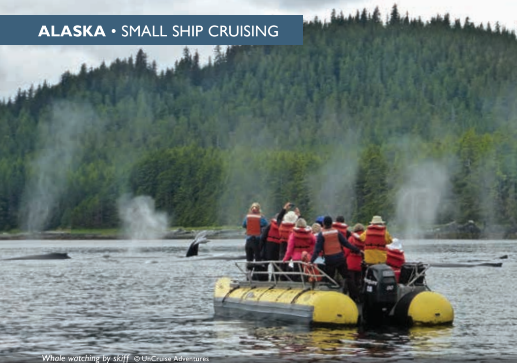
Whale watching by skiff