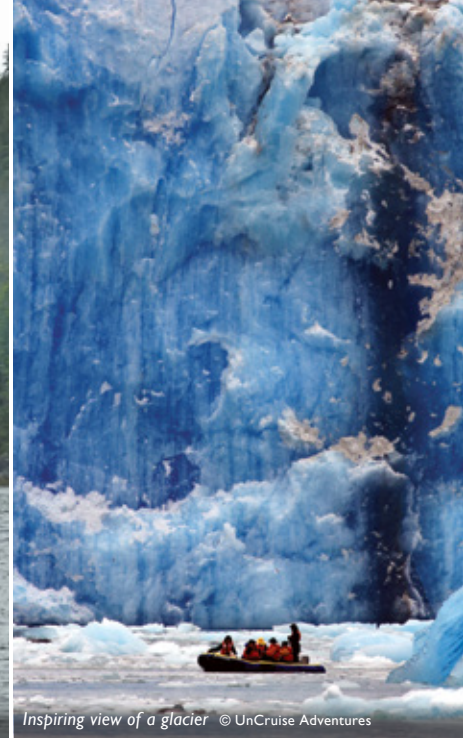
Inspiring view of a glacier