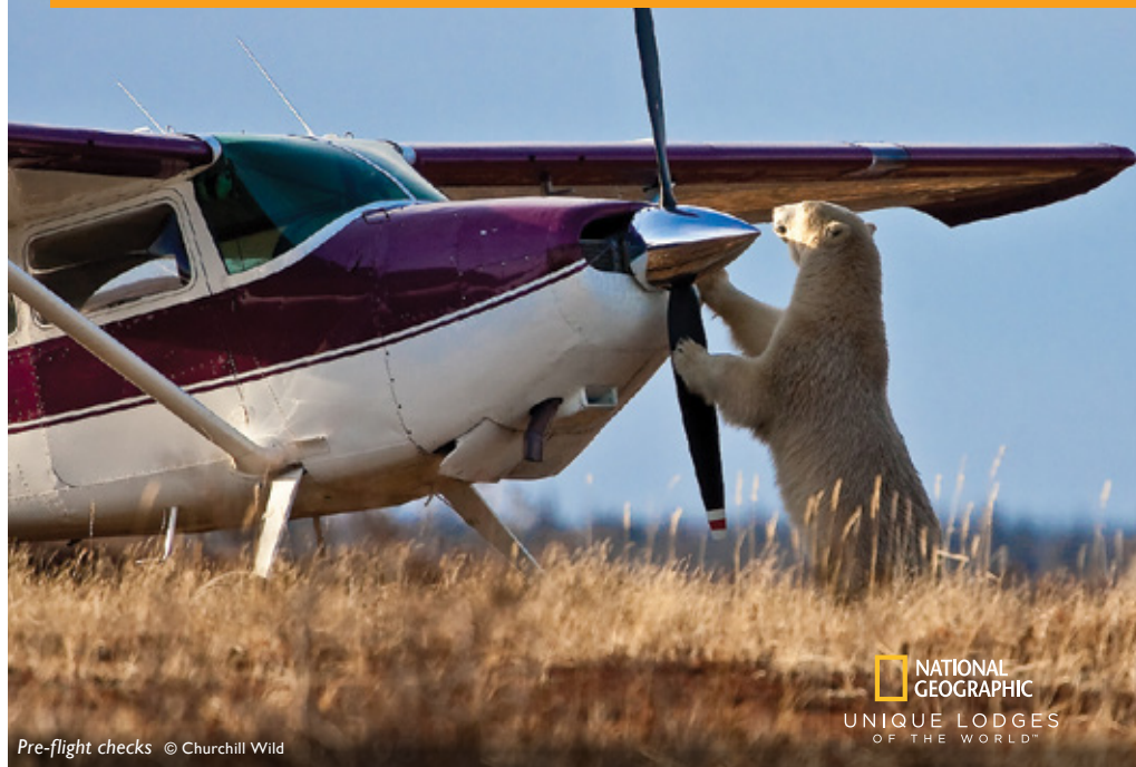
Pre-flight checks

NATIONAL GEOGRAPHIC UNIQUE LODGES OF THE WORLD™