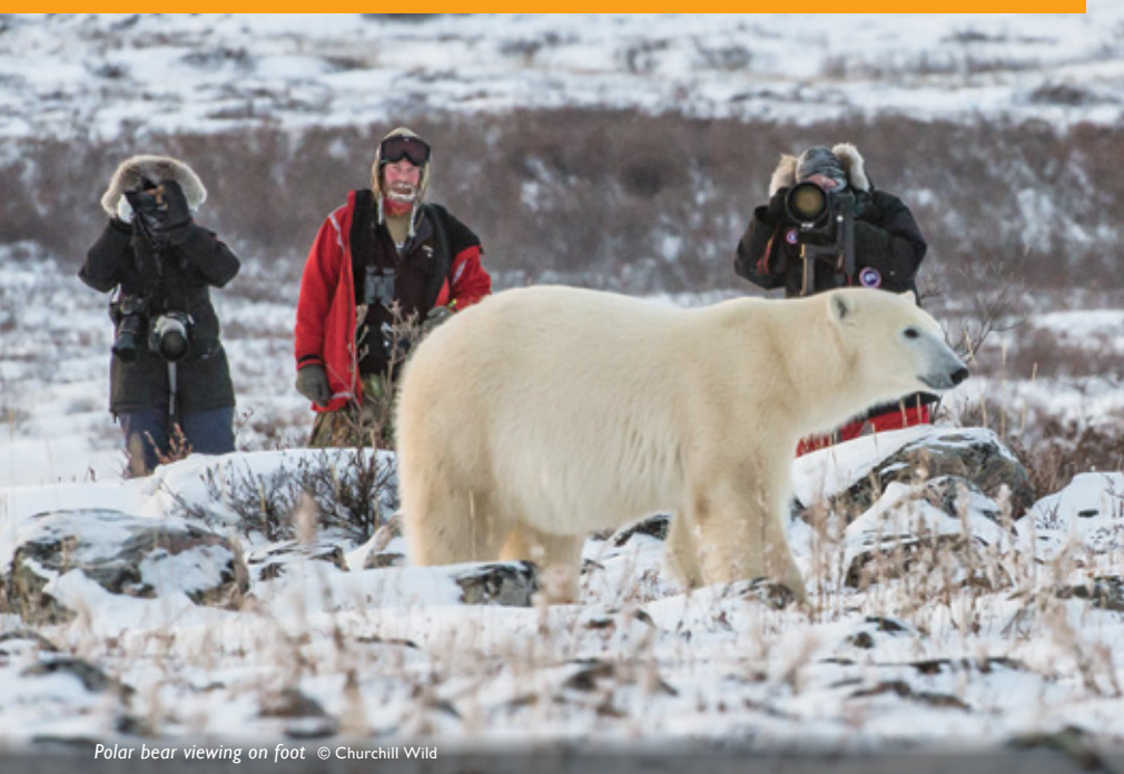
Polar bear viewing on foot