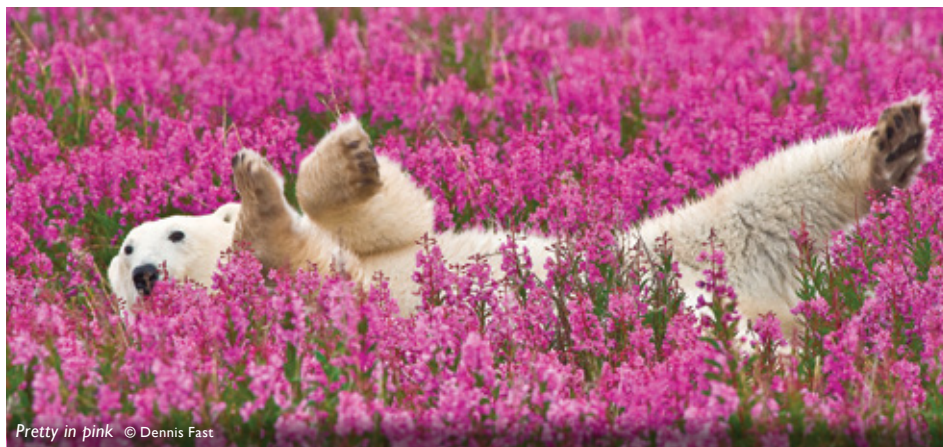
Pretty in pink