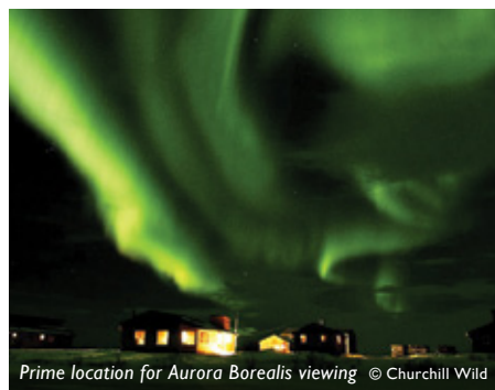
Prime location for Aurora Borealis viewing

After a hearty hot breakfast, rug up and set off on a morning walk with a good chance of seeing polar bears. Lunch is served back at the lodge, while evening meals encourage chatting with your fellow guests. You'll also enjoy regular slide shows or informative talks about native wildlife. Ask to be awoken at night for bear or Aurora Borealis viewing. BLD