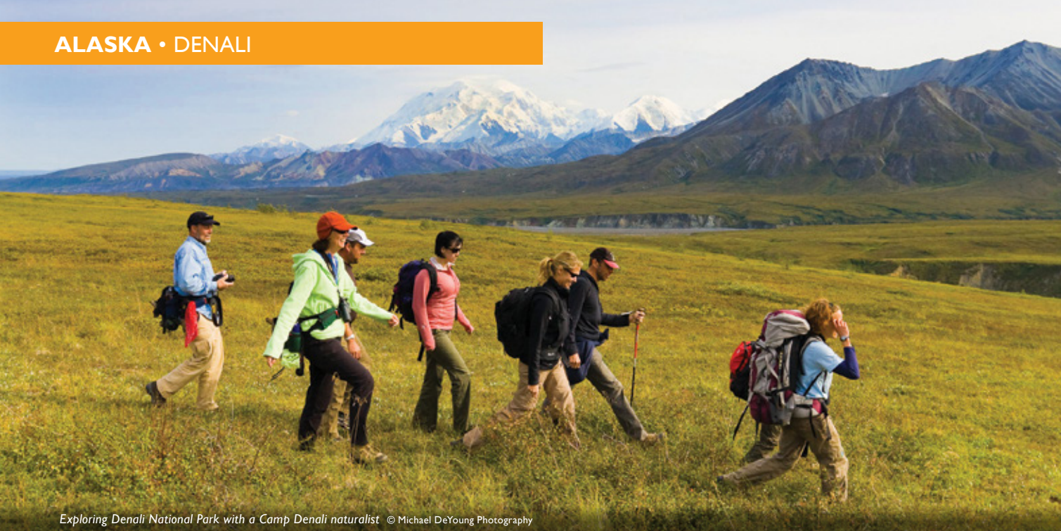
Exploring Denali National Park with a Camp Denali naturalist