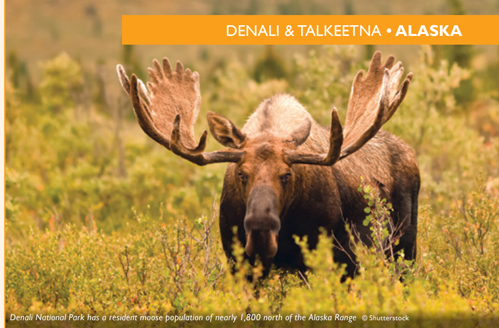
Denali National Park has a resident moose population of nearly 1,800 north of the Alaska Range