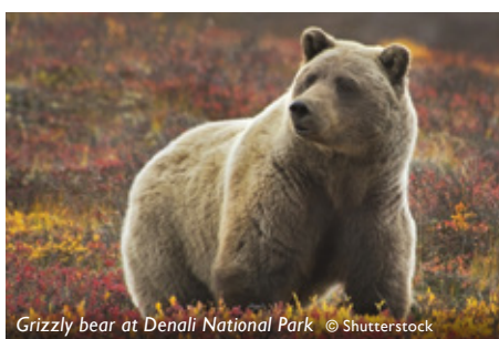
Grizzly bear at Denali National Park