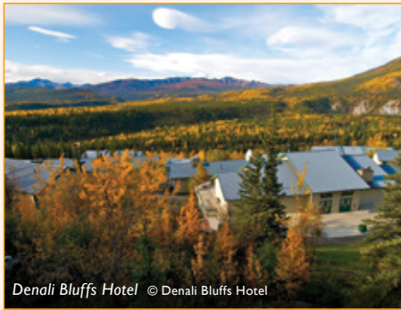
Denali Bluffs Hotel

D iscover the natural wonders of Denali National Park with a full day bus tour which travels the full extent of the wilderness road and also visits the remote Kantishna backcountry area.