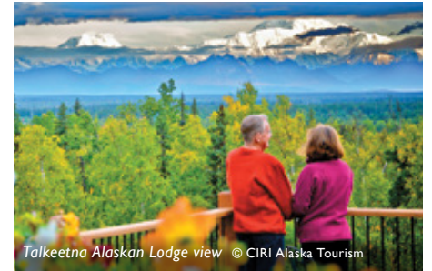
Talkeetna Alaskan Lodge view

Courtesy shuttle to Talkeetna for the 1700 train to Anchorage arriving 2000.