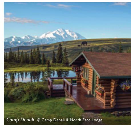
Camp Denali

Day 5 Tour ends Anchorage Bus to Denali, connect with Anchorage train. Tour ends.