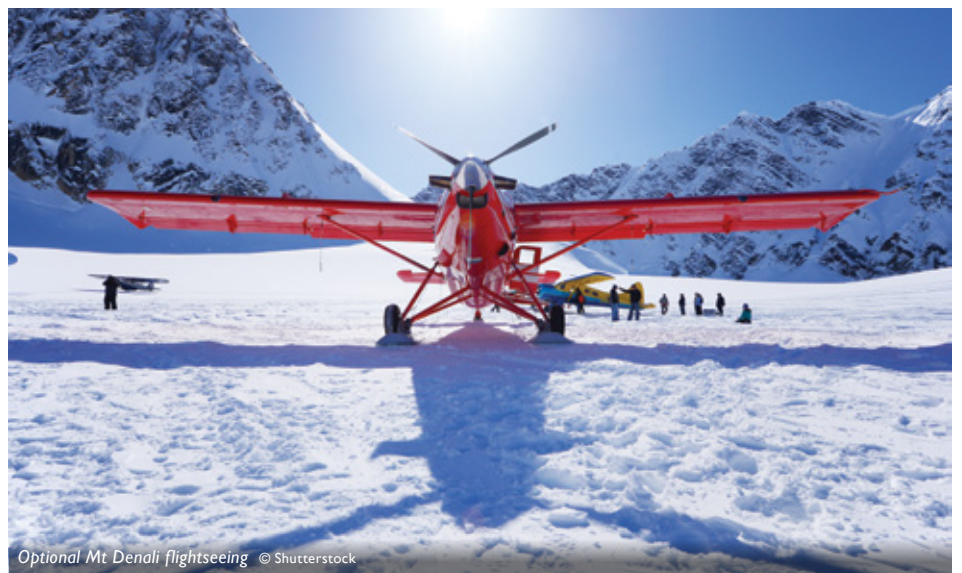
Optional Mt Denali flightseeing