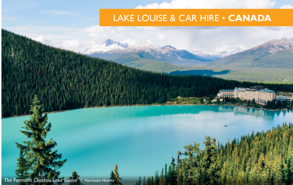
The Fairmont Chateau Lake Louise

Set within a charming 1920s hand-hewn wooden lodge, this historic property has 71 well-appointed ensuite rooms, a state-of-the-art rooftop hot tub, a traditional sauna and restaurant. Walk to the area's many heritage landmarks or to the famous lake.