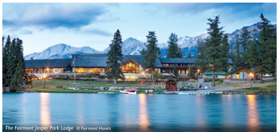
The Fairmont Jasper Park Lodge