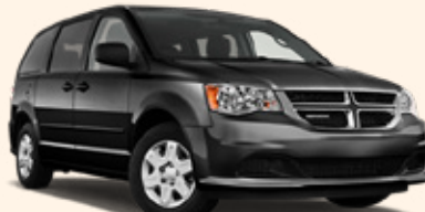
Dodge Grand Caravan © AVIS Canada