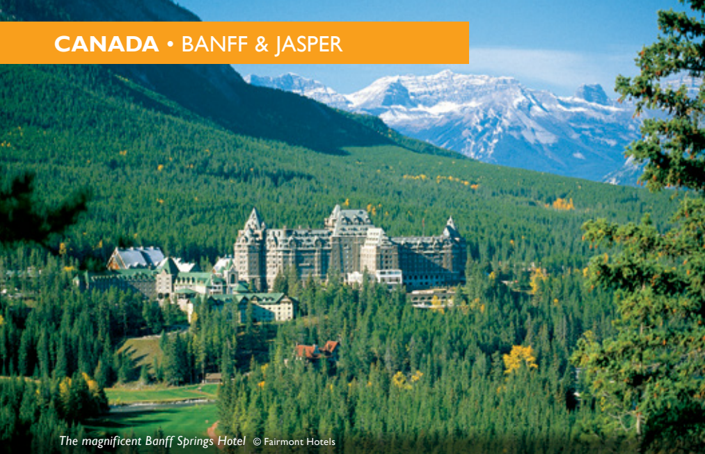
The magnificent Banff Springs Hotel