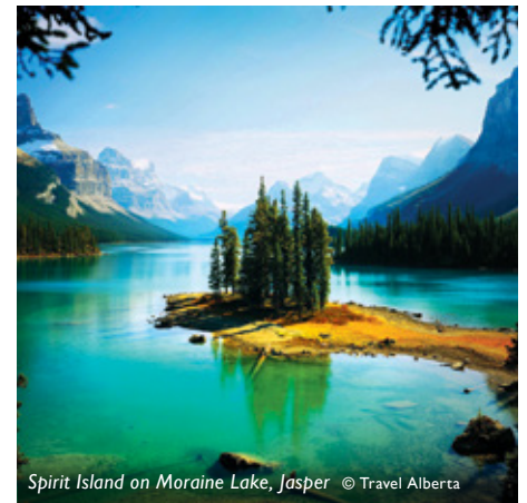
Spirit Island on Moraine Lake, Jasper

This 99-room hotel offers contemporary guestrooms, self-contained suites, free Wi-Fi, an onsite restaurant, an indoor pool, a hot tub and fitness room. The many attractions of downtown Jasper are conveniently just minutes away.