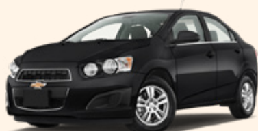
Chevrolet Sonic

Prices per 24hr period for unlimited kms (min 48hr rental period). Conditions apply. Please contact us for full details.