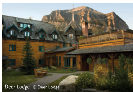
Deer Lodge