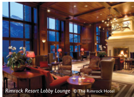
Rimrock Resort Lobby Lounge

This chateau-style resort is a mere 1km from the town centre. Inspired by a Scottish baronial castle, this landmark property offers 764 guest rooms, many restaurants, outdoor and indoor pools, a health club, a world-class European-style spa, tennis courts, horses, shops and two golf courses.