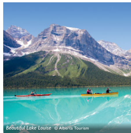
Beautiful Lake Louise

If you wish to visit the area independently, but don't want to hire a car, the best way to Banff, Lake Louise and Jasper is via shuttle bus transfer from Calgary.