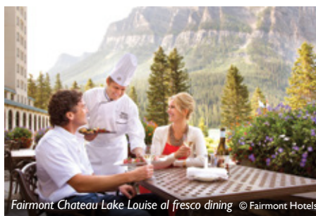
Fairmont Chateau Lake Louise al fresco dining