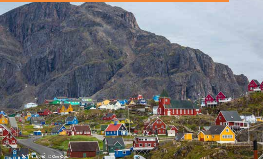
Baffin Island