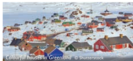
Colourful houses in Greenland

All prices shown are per person based on entry level twin share cabins. Optional single occupancy is from 1.5 to 2 times the twin share rate. We may be able to arrange shared accommodation. Please contact us for other cabin prices.