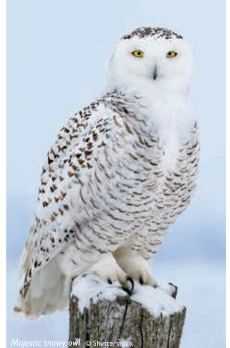
Majestic snowy owl