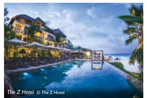
The Z Hotel

Set on an award-winning beach, the 30 one and two bedroom villas allude to a grand era of Sultans, with handcrafted furniture and private plunge pools. This fully inclusive resort's extensive facilities include a spa, yoga and fitness centre, tennis court, kids' club, library and shop.