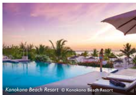
Konokono Beach Resort

Experience vibrant Zanzibar at peaceful Matemwe Lodge, where all 12 guest suites have blissful ocean views. Nearby Matemwe Retreat consists of 4 private air-conditioned villas, each with rooftop terrace, swimming pool and amazing vistas.