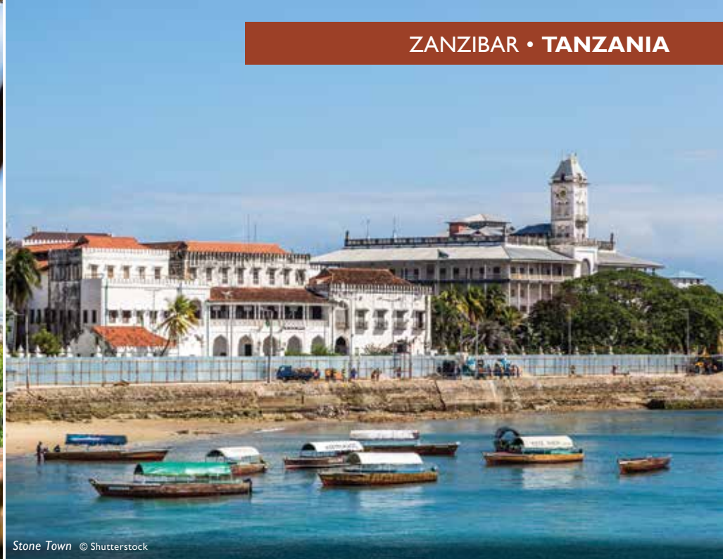
Stone Town