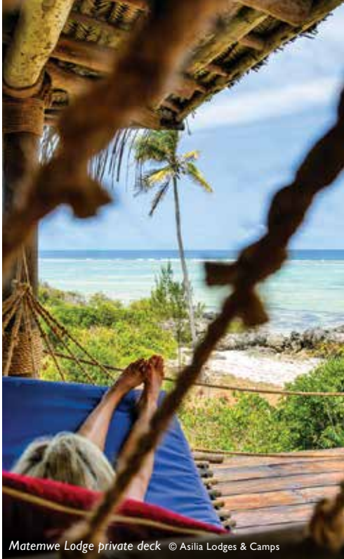
Matemwe Lodge private deck