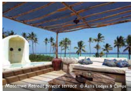
Matemwe Retreat private terrace