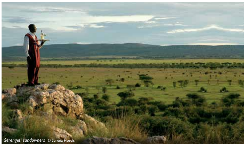
Serengeti sundowners