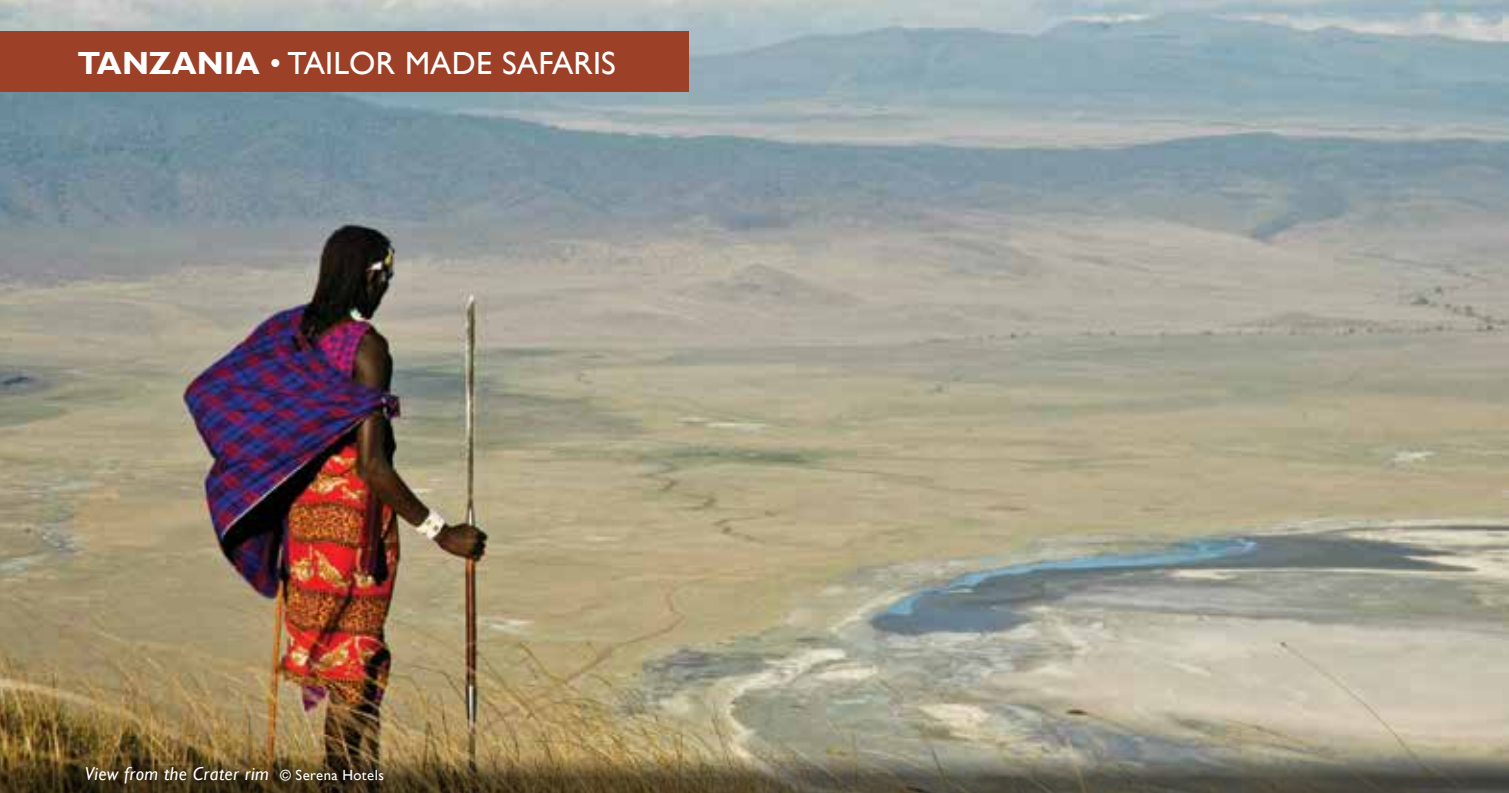
View from the Crater rim