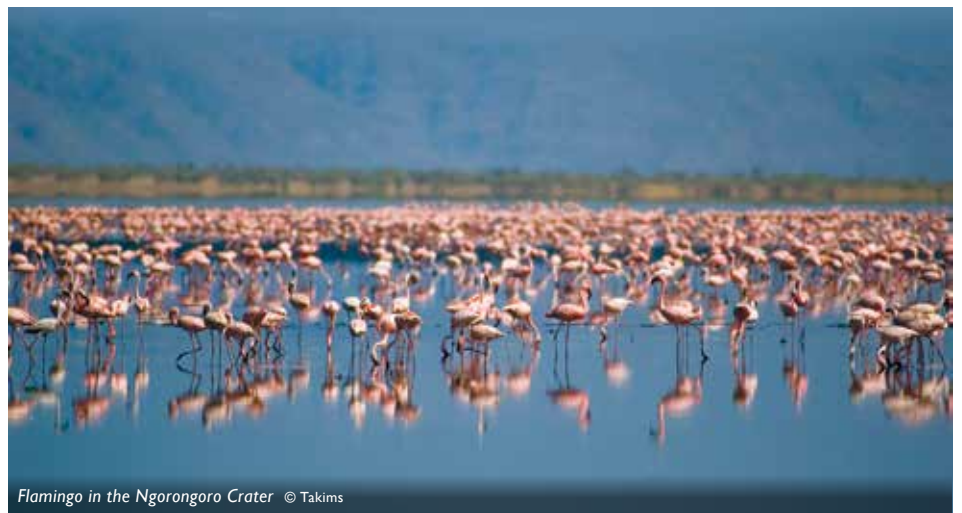
Flamingo in the Ngorongoro Crater

Choose from the lodges featured on page 126.