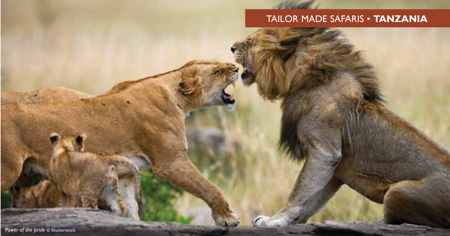
Power of the pride