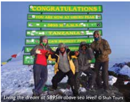
Living the dream at 5895m above sea level!

Base camp is at the Mountain Inn, a comfortable hotel just 6km from Moshi with 24 ensuite rooms, a restaurant, garden and swimming pool. Nights on the mountain are spent in high-quality 3-person alpine tents sleeping a maximum of two people per tent (so there is space for luggage).