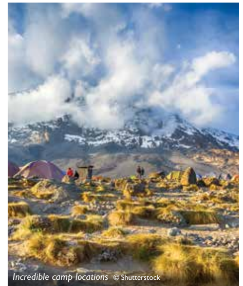
Incredible camp locations