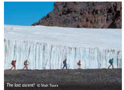
The last ascent!

The Lemosho Route starts on the western side and is an unspoilt, remote and very beautiful route to the Shira Plateau. The trail leads up to the western edge of the Shira Plateau, and the hike across the plateau is said to be one of the most stunning in Africa. (Climbers may be accompanied on the first day by an armed ranger, as the forests around the Lemosho Glades are rich with buffalo, elephant and other big game animals).