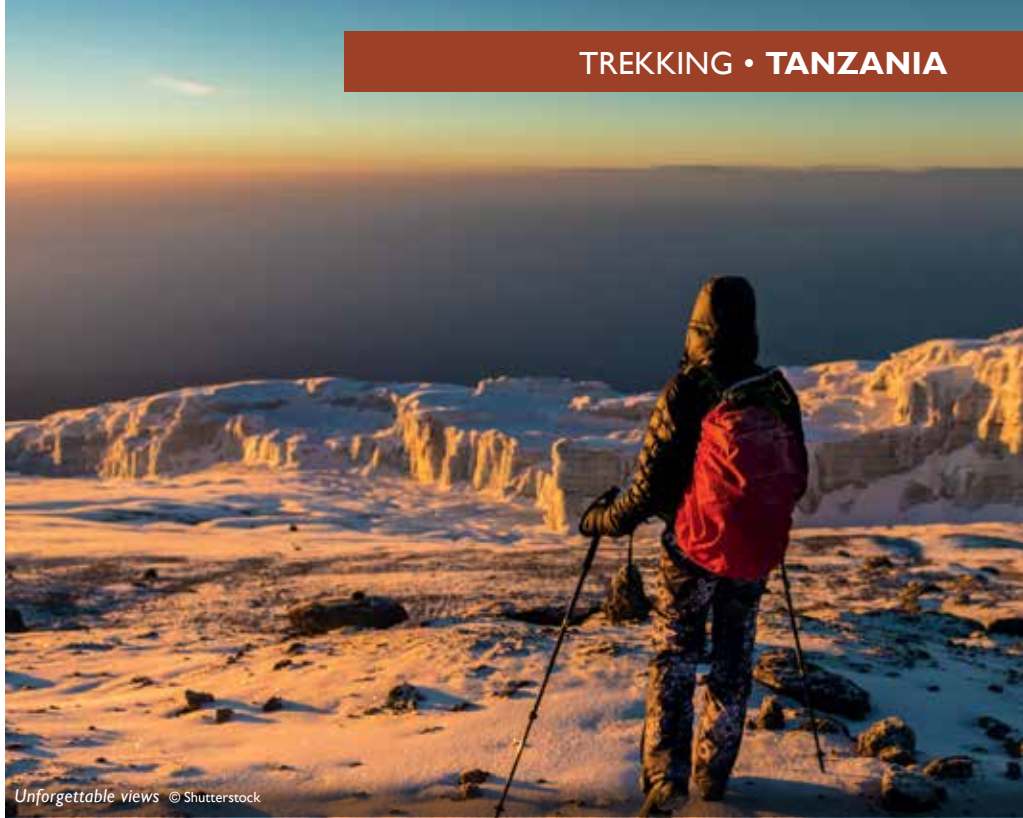
Unforgettable views