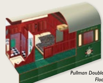
Pullman Double Suite Floor Plan

Rovos Rail's beautifully restored sleeper coaches contain the most spacious train suites in the world. Period Victorian features are combined with modern comforts, and each air-conditioned suite accommodates two people in twin or double beds. Pullman Suites (7sqm) have an ensuite with shower and a comfortable sofa-seat that converts to double or twin beds for sleeping. Deluxe Suites occupy 10sqm with ensuite bathrooms and lounge areas. The Royal Suites each take up half a carriage and are a spacious 16sqm, with a lounge area and ensuite bathroom with a Victorian claw-foot bathtub.