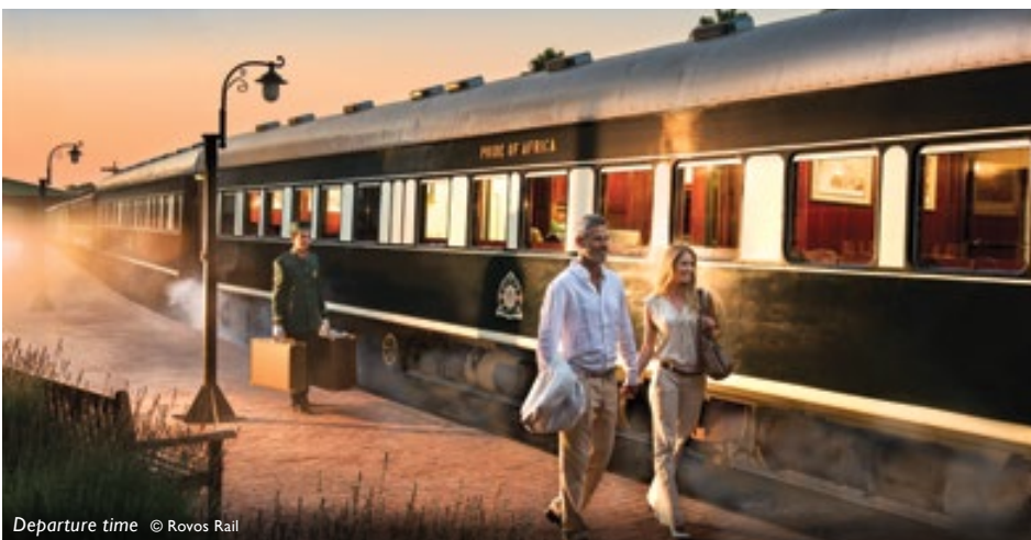
Departure time

*Design and layout of the suites subject to change