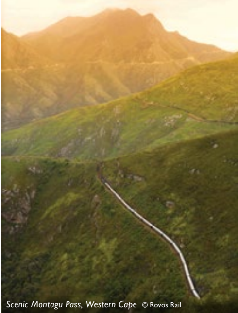
Scenic Montagu Pass, Western Cape