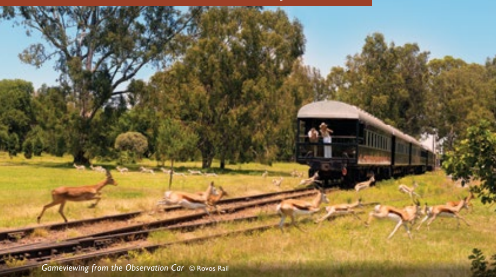
Gameviewing from the Observation Car