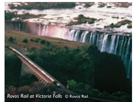
Rovos Rail at Victoria Falls

Each of the five Rovos Rail locomotives were saved from the scrap heap and restored to their former glory. Whenever possible journeys start or end with a steam engine pulling the train out of or into Pretoria station, adding to the authentic atmosphere of the occasion. At all other stages throughout the journey, diesel or electric engines are used. Capital Park in Pretoria has also been completely renovated and is now Rovos Rail's private station. The yards house the complete rolling stock in vast carriage and loco sheds and there is also a small railway museum.