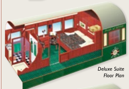
Deluxe Suite Floor Plan