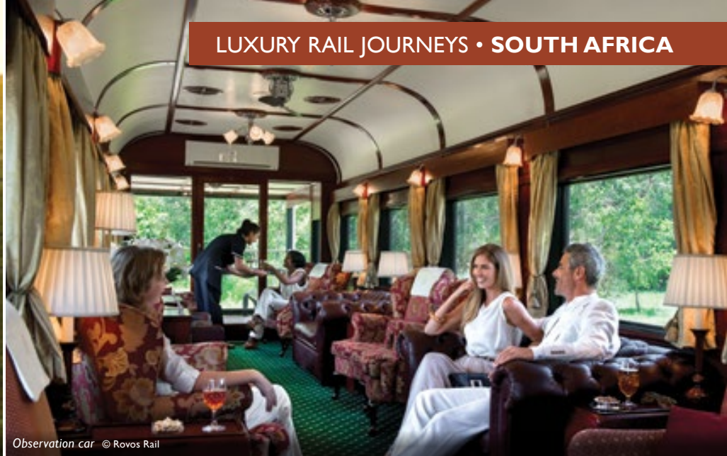
Observation car