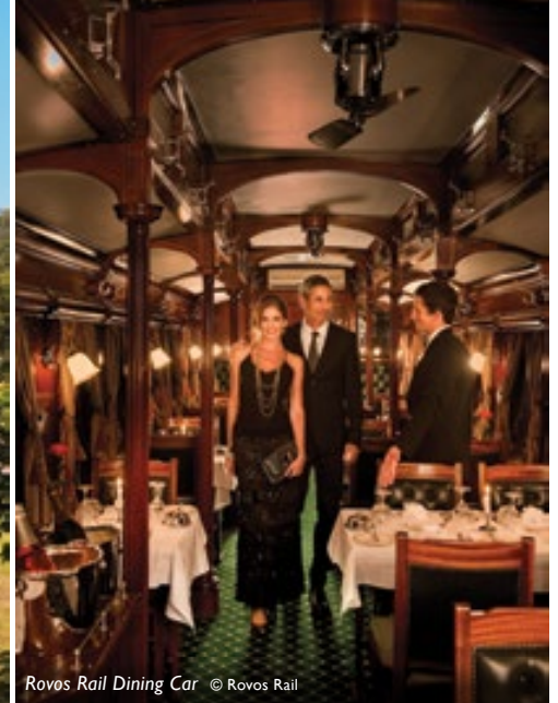
Rovos Rail Dining Car