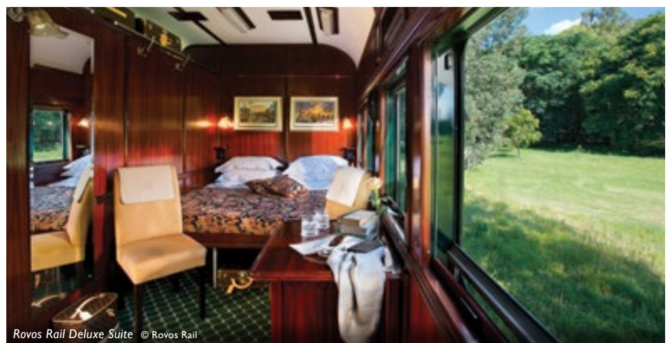
Rovos Rail Deluxe Suite