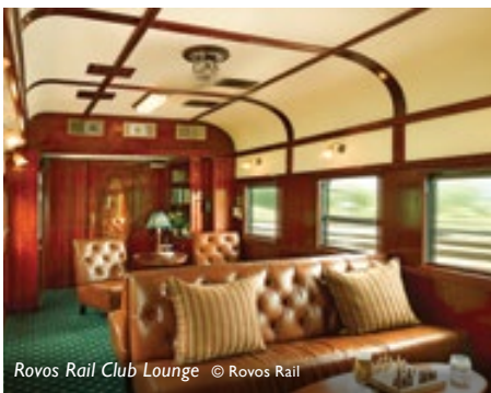
Rovos Rail Club Lounge