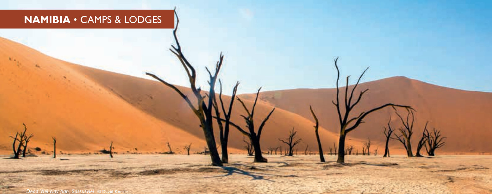
Dead Vlei clay pan, Sossusvlei