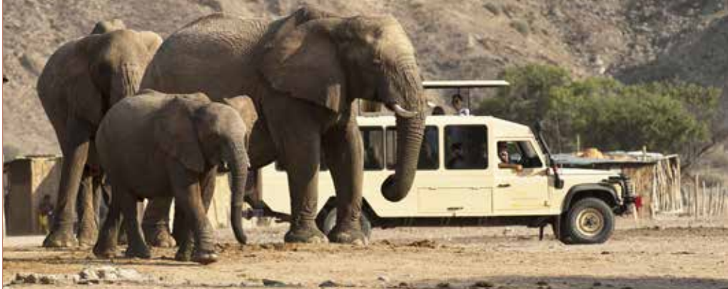
Herd of elephant in Damaraland