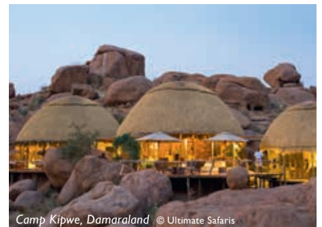
Camp Kipwe, Damaraland

Drive through a vast landscape of magnificent mountains, rock formations and unique vegetation to Damaraland. Visit the prehistoric Twyfelfontein rock engravings, the Organ Pipes geological site and enjoy a game drive in search of the unique desert adapted elephant. Overnight at Camp Kipwe. BLD