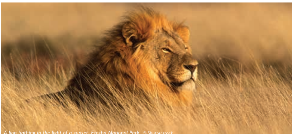
A lion bathing in the light of a sunset, Etosha National Park

Early departure for the AfriCat Day Centre wildlife sanctuary in Okonjima before returning to Windhoek where the safari ends. BL