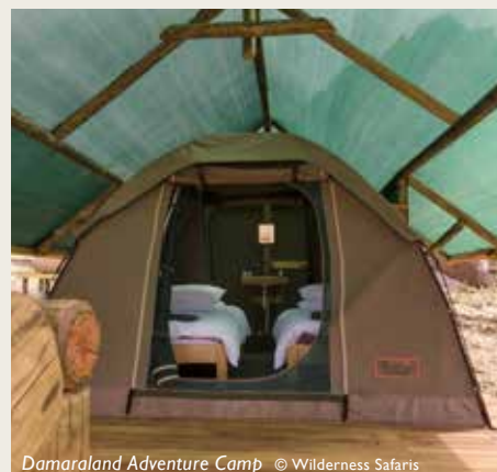
Damaraland Adventure Camp

Continue via Cape Cross to Damaraland Adventurer Camp. Enjoy day and night nature walks, viewing the rock engravings at Twyfelfontein and game drives. BLD