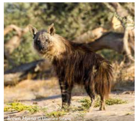
Brown Hyena