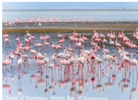
Flock of flamingos, Walvis Bay

Depart Windhoek early morning by road for Sossusvlei arriving at Sossus Dune Lodge mid-afternoon. Time permitting, visit nearby Sesriem Canyon or explore Elim Dune. On Day 2 enjoy a sunrise tour of the magnificent sand dunes before returning to the lodge for lunch. Afternoon at leisure. LD/BLD