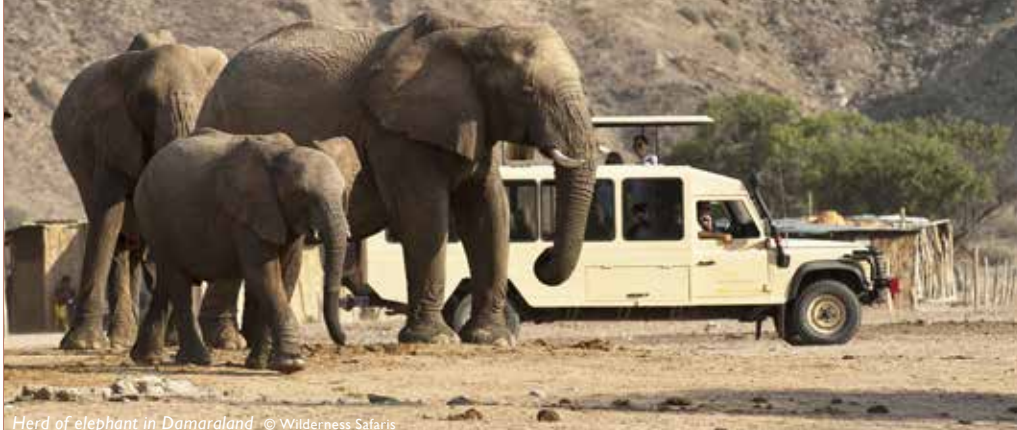
Herd of elephant in Damaraland