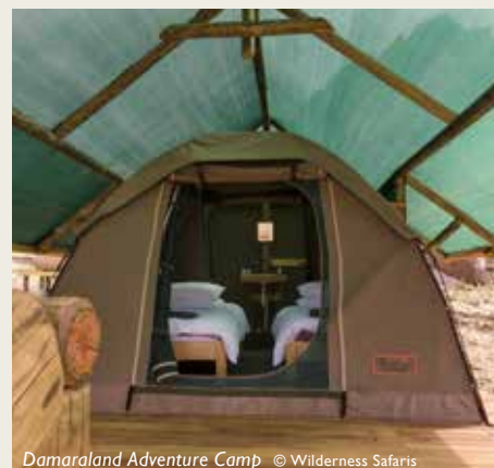
Damaraland Adventure Camp

Continue via Cape Cross to Damaraland Adventurer Camp. Enjoy day and night nature walks, viewing the rock engravings at Twyfelfontein and game drives. BLD