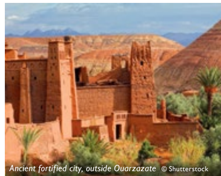
Ancient fortified city, outside Ouarzazate

3 day/2 night tour cost from: $623 p.p. twin staying at the Villa De L'ô (standard room). Please contact us for further details.