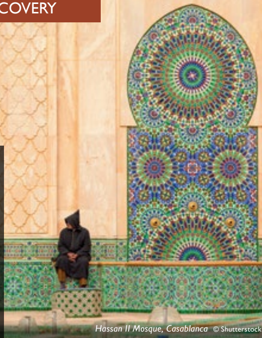
Hassan II Mosque, Casablanca

With its rich history and fascinating heritage Morocco exudes mystery and romance. Featuring a unique blend of the African Berber, Arab and Mediterranean cultures, for centuries travellers have crossed shifting sands and braved mountain passes seeking out the exotic wonders and marvels of this unique country. Discover landscapes rich in graceful Arabic architecture, colourful souks, palaces, traditional riads, rugged gorges and bustling medinas full of traders.