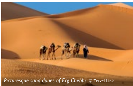
Picturesque sand dunes of Erg Chebbi

3 day/2 night tour cost from: $668 p.p. twin Please contact us for further details.