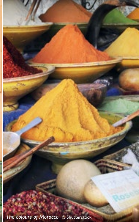
The colours of Morocco