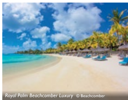
Royal Palm Beachcomber Luxury

This elegant hotel is reminiscent of the grand plantation mansions of the 1920s. The 135 luxurious rooms and 28 suites have personal butler service and spacious terraces or balconies. The Residence has 3 restaurants, a poolside cafe, bar, swimming pool, spa, sauna, boutiques and kids' club. A range of watersports, tennis and beach volleyball are included. Children welcome.