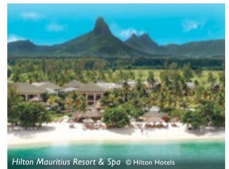
Hilton Mauritius Resort & Spa

The prestigious Royal Palm Beachcomber Luxury is fringed by landscaped gardens, a white sandy beach and the turquoise Grand Baie Lagoon beyond. Tranquil and intimate, all 69 spacious suites face the water, and each one boasts a private terrace or balcony. The resort has 3 onsite gourmet restaurants led by an acclaimed chef, 3 heated swimming pools, a Spa by Clarins and a sports centre.