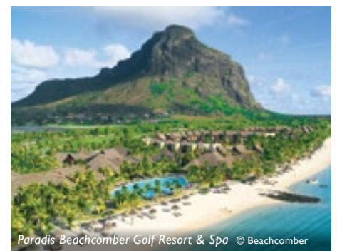
Paradis Beachcomber Golf Resort & Spa

This award-winning resort is found on one of the island's most famous beaches, Flic-en-Flac , nestled on the island's sheltered west coast. All the rooms and suites enjoy garden or ocean views, and are decorated in contemporary Mauritian style. In addition to extensive sports and leisure facilities, this fabulous Hilton property has 3 restaurants, a day spa as well as plenty of activities for kids of all ages.