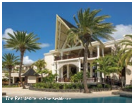
The Residence