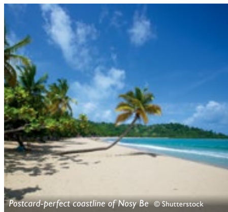
Postcard-perfect coastline of Nosy Be

Transfer to the airport for your return flight to Antananarivo. B