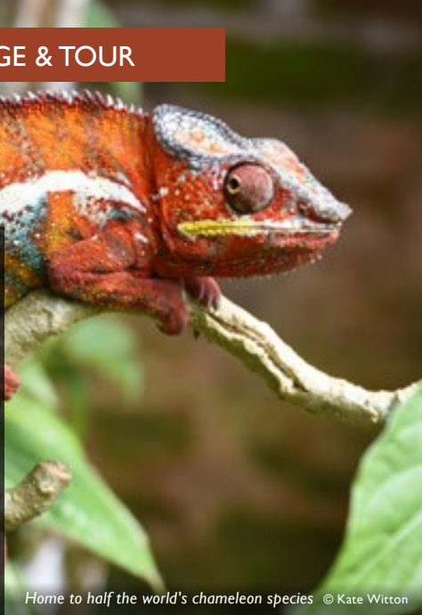
Home to half the world's chameleon species

The world's fourth largest island, Madagascar is a strange land of exotic landscapes resplendent in their variety, ranging from palm-fringed beaches to spiny forests and limestone labyrinths. A nature lover's dream, it shelters a plethora of unique species from baobabs to chameleons and lemurs. It's important to note that the country has very limited infrastructure for tourism, so even seasoned travellers may find the country's services and accommodation challenging at times. However, that's all part of the adventure!