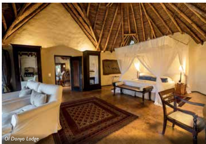
Ol Donyo Lodge