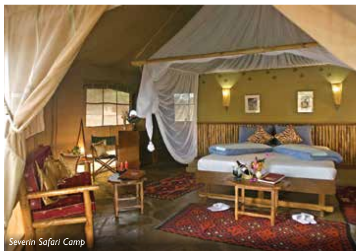
Severin Safari Camp