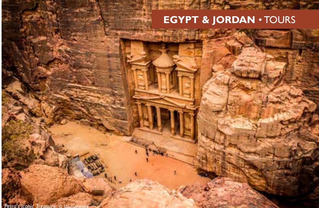
Petra's iconic Treasury