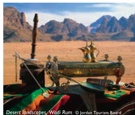
Desert landscapes, Wadi Rum

Travel the King's Highway to Petra, stopping to see a 6th century mosaic map of Palestine. Visit Mt Nebo, said to be the last resting place of Moses, and impressive Kerak Castle. On Day 4, be guided along the narrow Siq to the lost city of Petra, with its exquisite Treasury and tombs. B