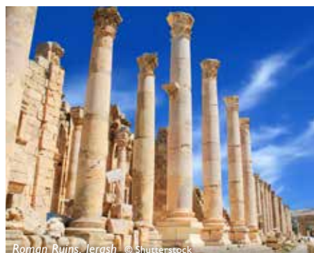
Roman Ruins, Jerash

Tour the Roman Theatre, Nymphaeum and Citadel. Transfer to the ancient Greco-Roman city of Jerash and walk its colonnaded streets and plazas, discover its temples, theatres, baths and the Arch of Hadrian. B