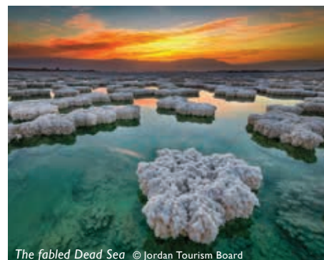
The fabled Dead Sea