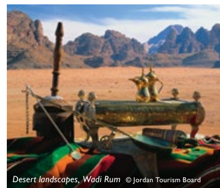
Desert landscapes, Wadi Rum

Travel the King's Highway to Petra, stopping to see a 6th century mosaic map of Palestine. Visit Mt Nebo, said to be the last resting place of Moses, and impressive Kerak Castle. On Day 4, be guided along the narrow Siq to the lost city of Petra, with its exquisite Treasury and tombs. B