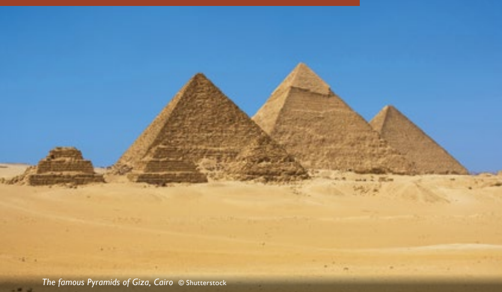
The famous Pyramids of Giza, Cairo