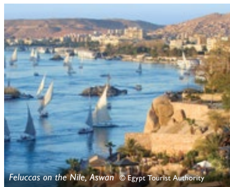
Feluccas on the Nile, Aswan

At Edfu, see the Temple of Horus, then travel to Kom Ombo, an unusual temple dedicated to gods Sobek and Haroeris. Overnight in Aswan. On day 7 go ashore to visit the famous Aswan High Dam. Stop at North Quarry for its giant Unfinished Obelisk still embedded in rock, before sailing to the Temple of Isis on Philae Island. Afternoon excursion to lush Elephantine Island (formerly Lord Kitchener's Island). BLD