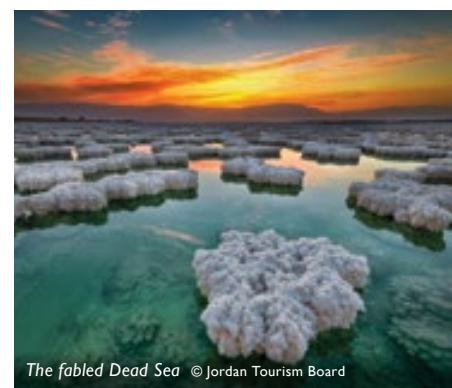
The fabled Dead Sea