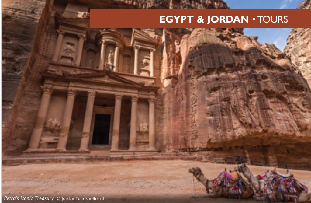
Petra's Iconic Treasury

3 day/2 night tour cost from $692 p.p twin (ex Cairo). Please contact us for more details.