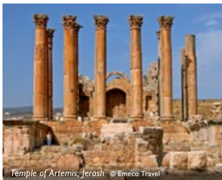
Temple of Artemis, Jerash

Tour the Roman Theatre, Nymphaeum and Citadel. Transfer to Jerash for ancient colonnaded streets, temples, theatres, baths and the Triumphal Arch of Hadrian. B