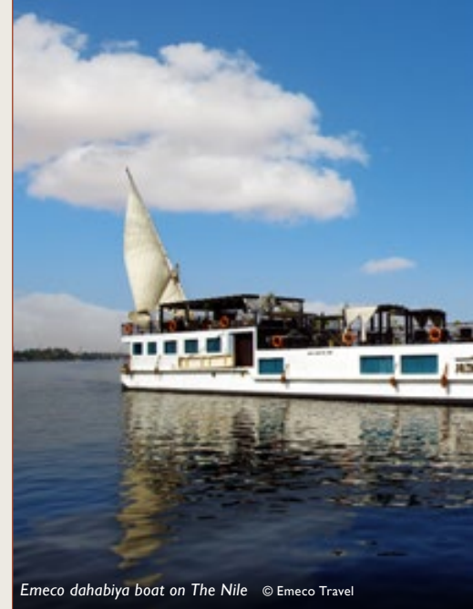
Emeco dahabiya boat on The Nile