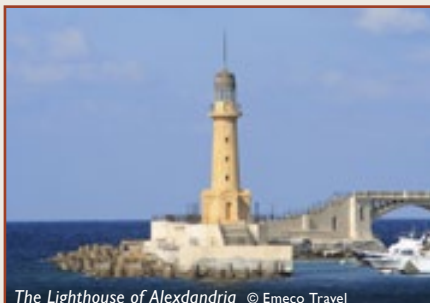
The Lighthouse of Alexandria

Optional visit to Abu Simbel this morning. Your trip concludes with disembarkation in Aswan. B