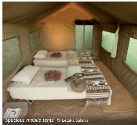
Spacious mobile tents

Fly by light aircraft to Xakanaxa airstrip where you will meet your guide and travel on to your comfortable camp for the next 3 nights. Discover wide open floodplains, lagoons and Mopane woodland on morning and afternoon game drives. Search for lion, elephant, buffalo and the endemic red lechwe antelope. Moremi is one of the best game reserves in Africa for viewing the endangered African wild dog.