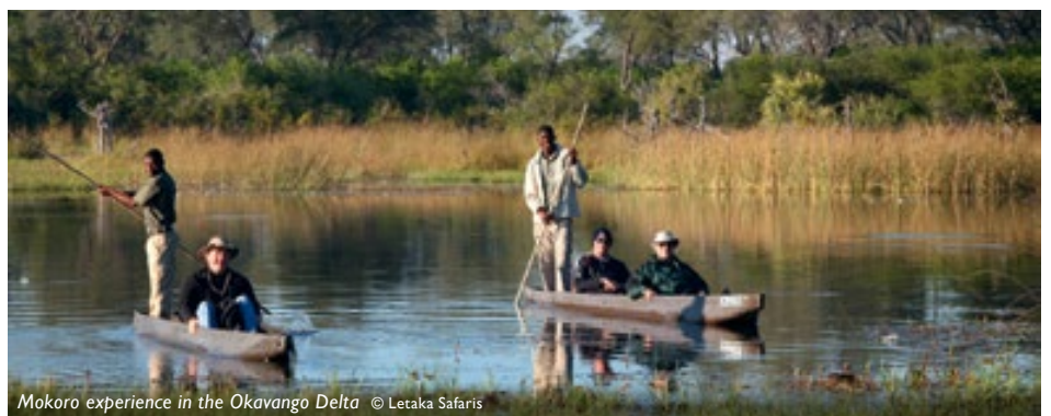
Mokoro experience in the Okavango Delta