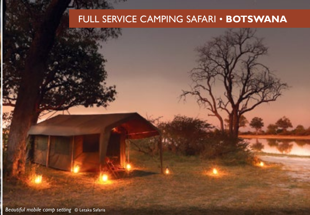
Beautiful mobile camp setting