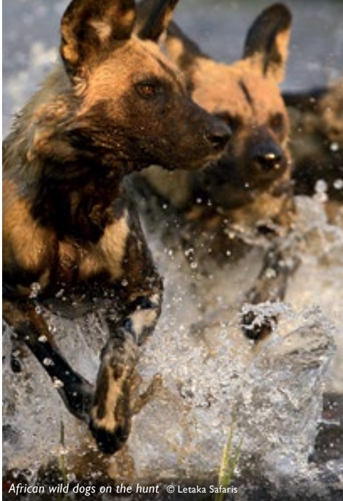
African wild dogs on the hunt