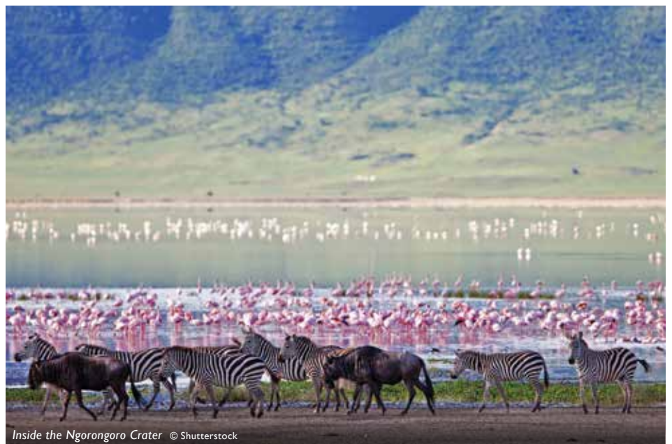
Inside the Ngorongoro Crater