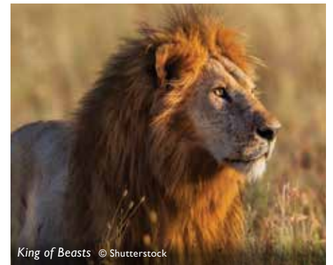
King of Beasts

Please contact us for full details and inclusions for this suggested itinerary, or to start custom designing a similar experience for you.