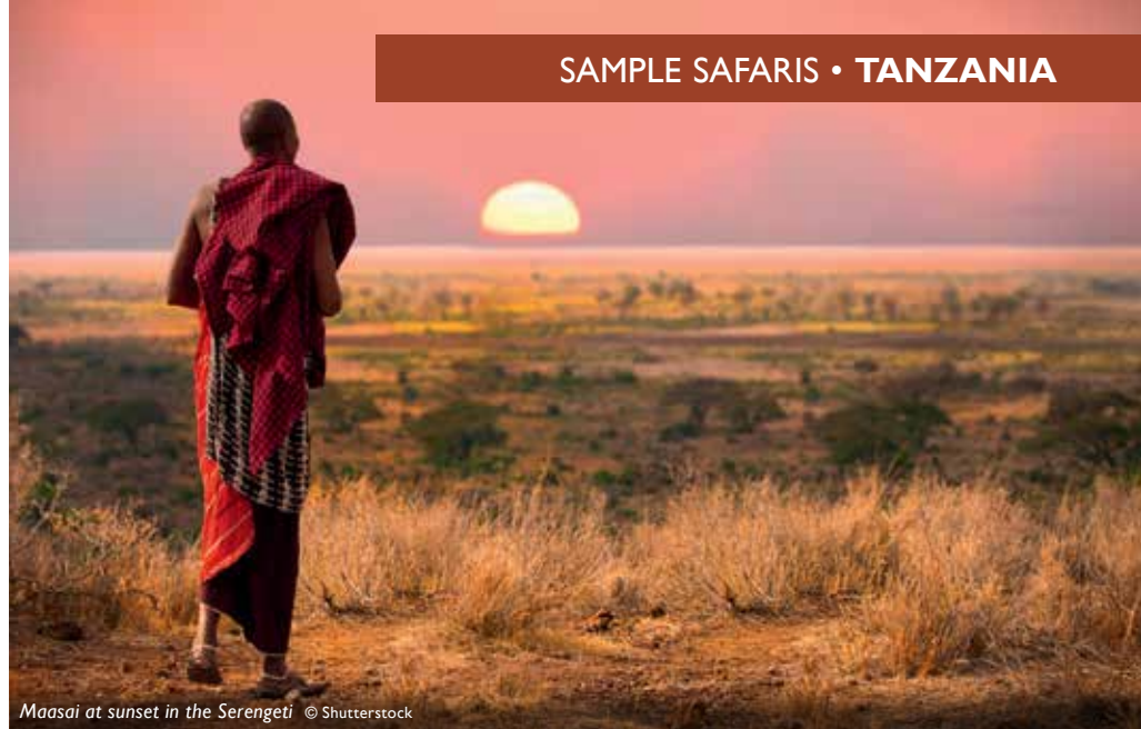
Maasai at sunset in the Serengeti

Please note that additional nights can be added to the Masai Mara and at all lodges in Tanzania. If you can afford the time, and your budget allows, we highly recommend you stay between 4-7 nights in the Serengeti to make the most of this very special place. Also note that the roads in Tanzania are very rough. If you would like to spend less time driving, and more time gameviewing, we can alter the itinerary slightly so you finish the Tanzania Lodge Safari in the Serengeti. You can then fly back to Arusha to continue on to Nairobi by road or air, or you can fly to Zanzibar for a beach break (see p142/143).