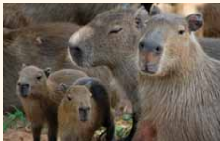
Los Llanos Capybaras