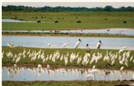
Los Llanos wetlands