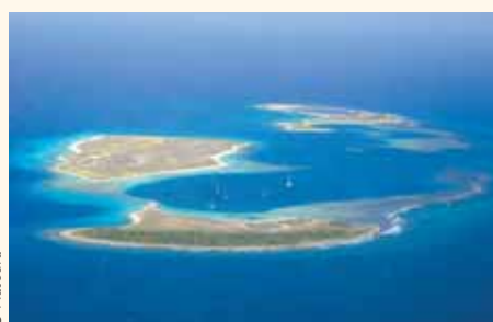
Los Roques Archipelago