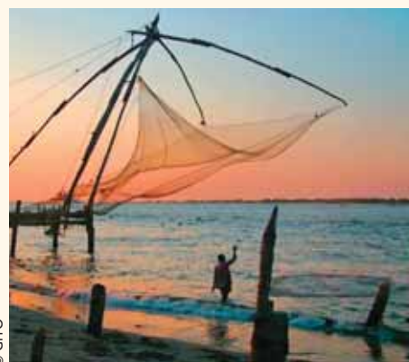
Chinese Fishing Nets, Kochi