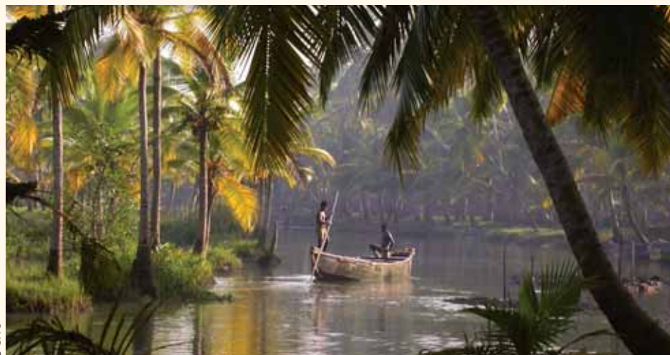
Beautiful waterways of Kerala