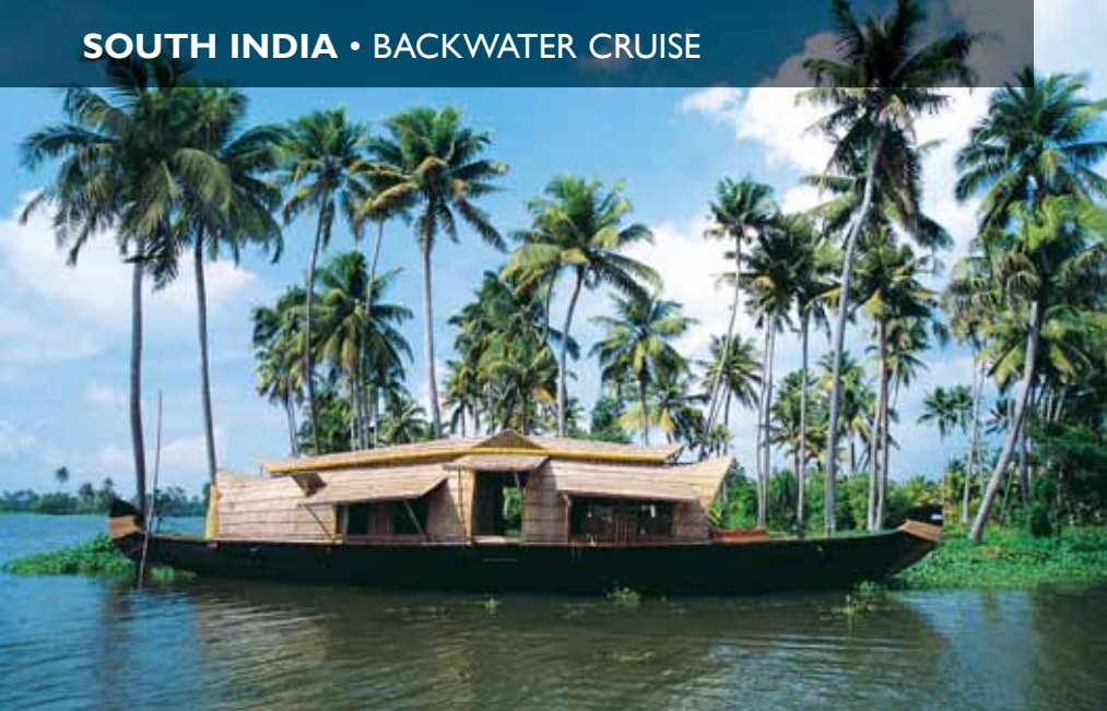
Houseboat, backwater cruise