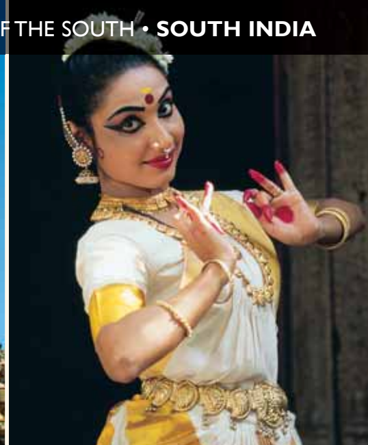
Bharatnatyam Dancer