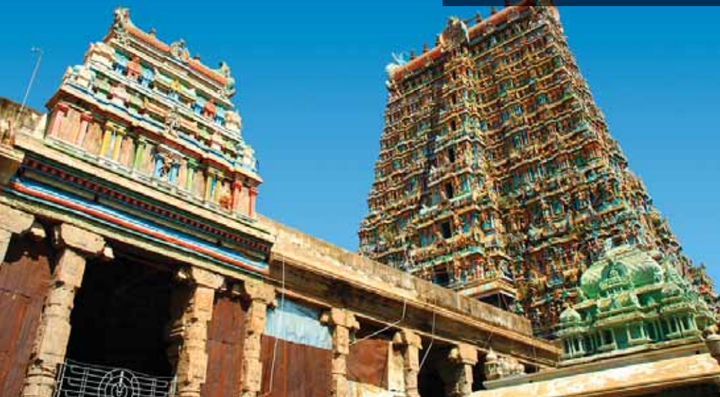
Meenakshi Temple