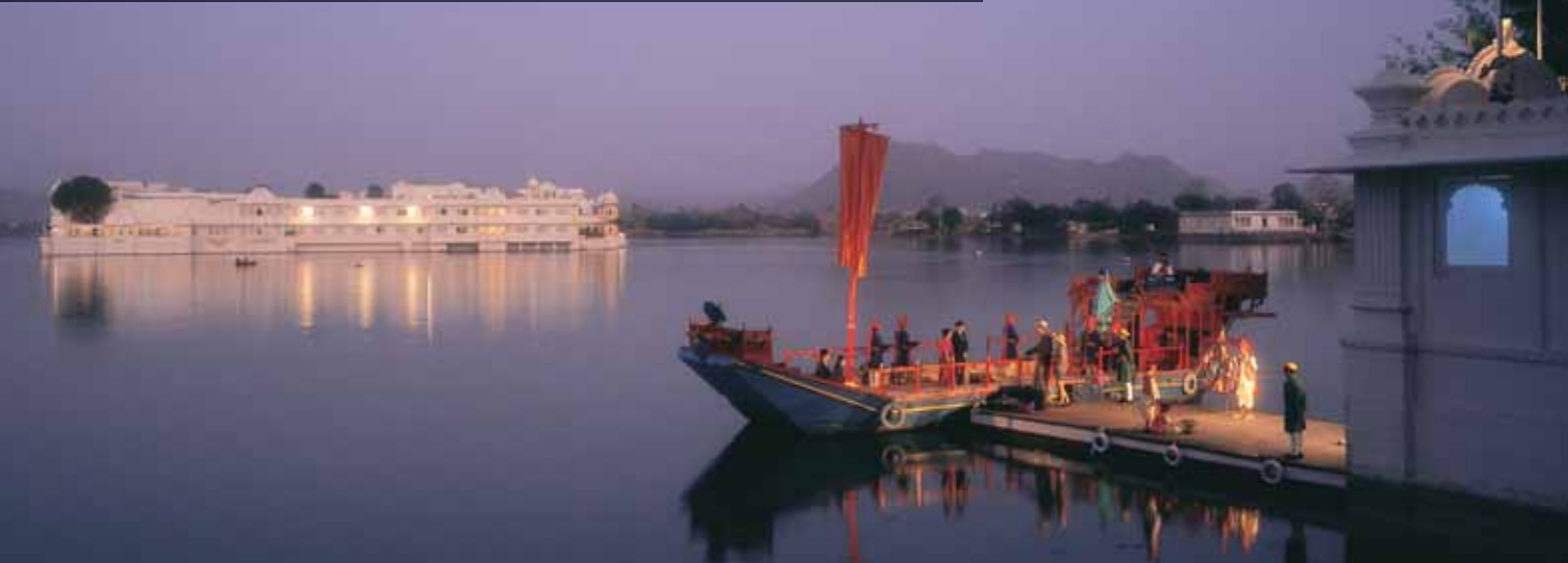
Lake Palace Hotel, Udaipur © Taj Hotels