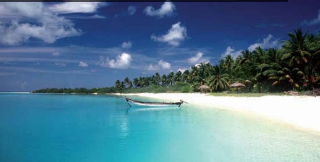
Goa's stunning beaches