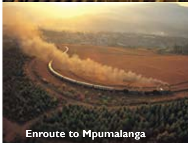
Enroute to Mpumalanga