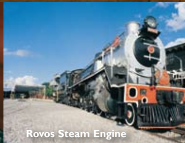
Rovos Steam Engine