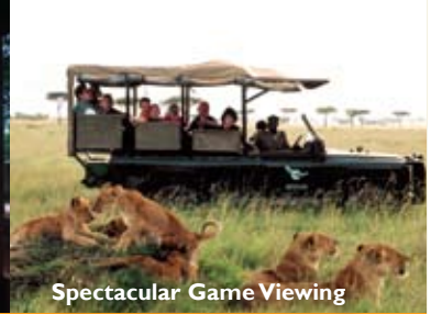
Spectacular Game Viewing