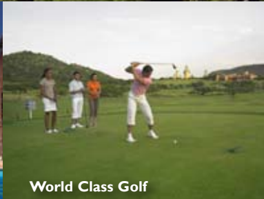
World Class Golf