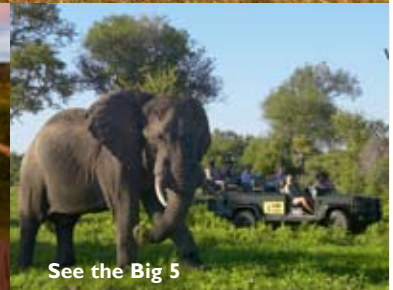
See the Big 5