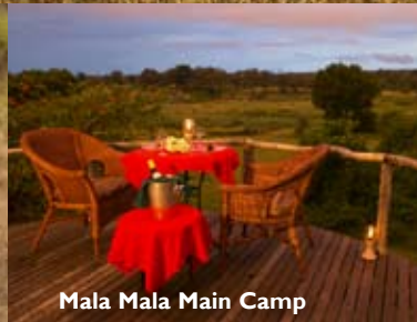
Mala Mala Main Camp