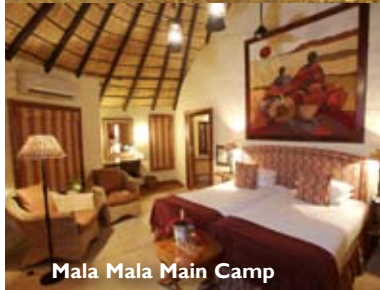
Mala Mala Main Camp