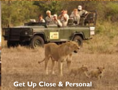
Get Up Close & Personal