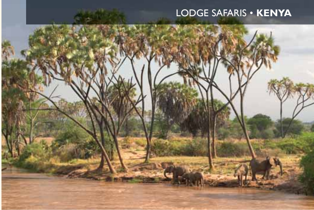
Stunning Samburu scenery

Morning game drive before your flight back to Nairobi. Arrival transfer to city hotel or airport.