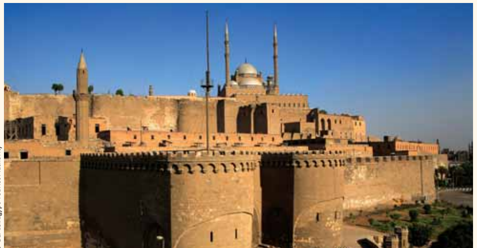
The Citadel, Cairo

Arrive Australia, connecting flight to destination.