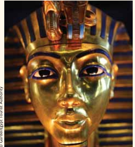
The Majestic Tutankhamun, Cairo

Itinerary as per Days 4 to Day 7 (incl) of the Legends of the Nile tour (see page 6) using the M/S TI-YI or similar. BLD