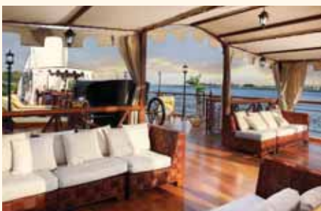
Sonesta Dahabiya deck lounge

Morning sail to Kom Ombo and visit the Ptolemaic Temple. Overnight moored beside a Nile island.