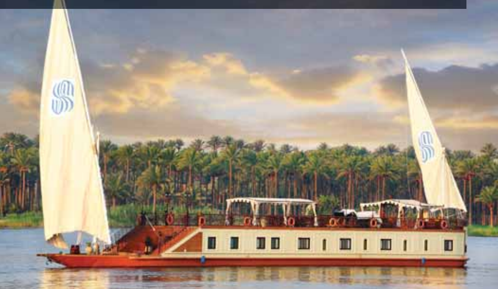
Sonesta Dahabiya