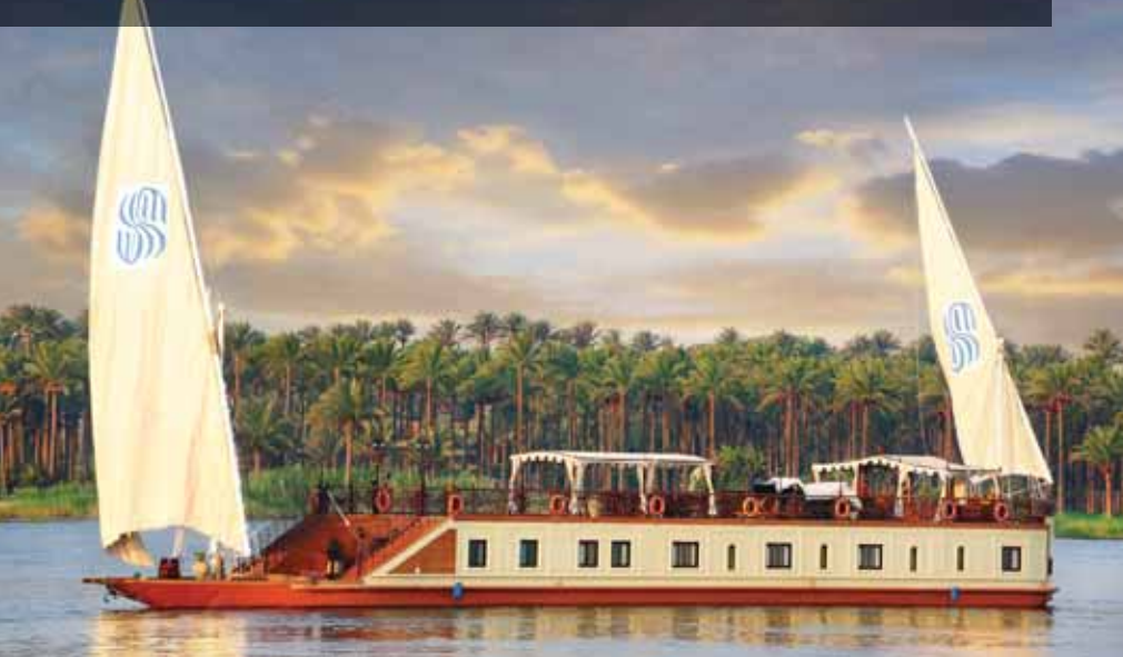
Sonesta Dahabiya