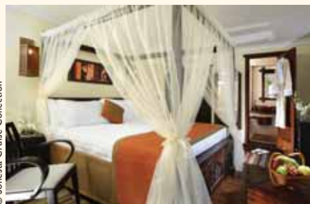
Sonesta Dahabiya bedroom