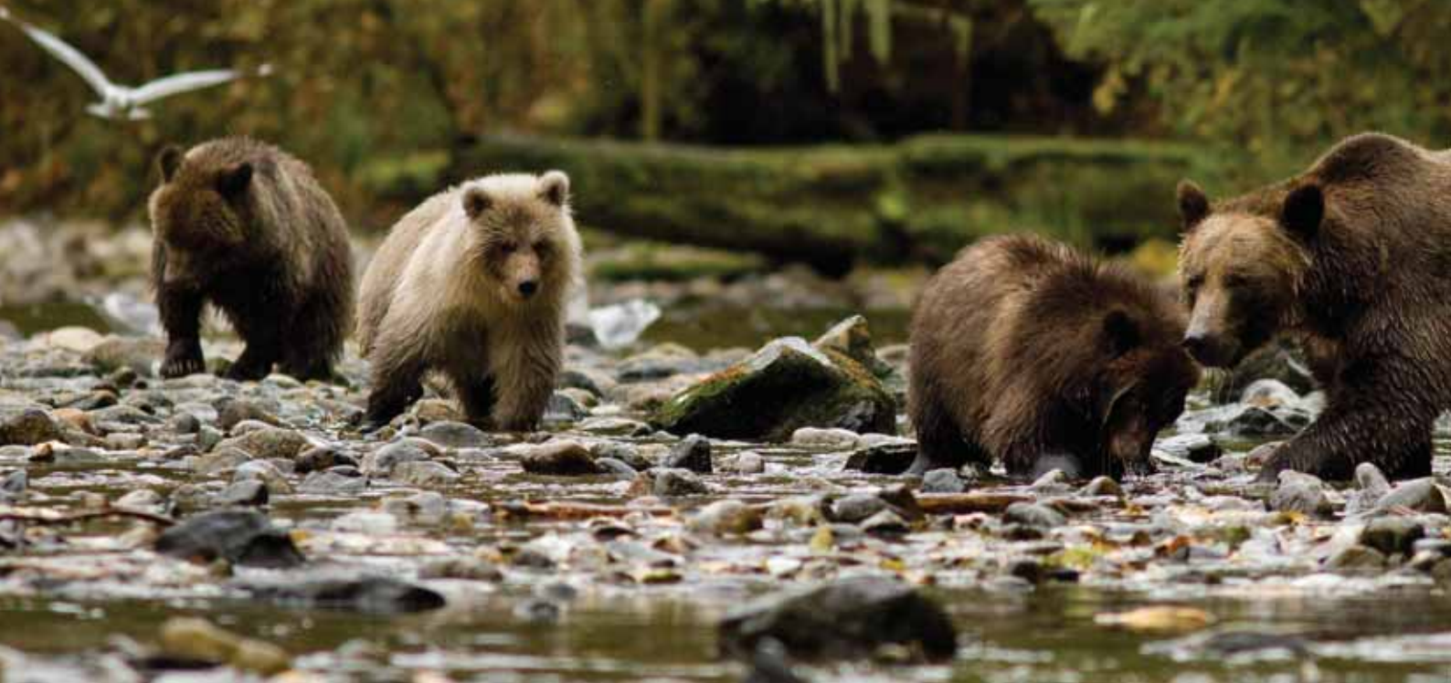
Knight Inlet Lodge - Premier Grizzly Bear viewing

“Thirty-five bear sightings in 5 days, seals and otters outside our room and Orca Whales just minutes from the lodge - I didn't want to leave!” Sara Cameron.