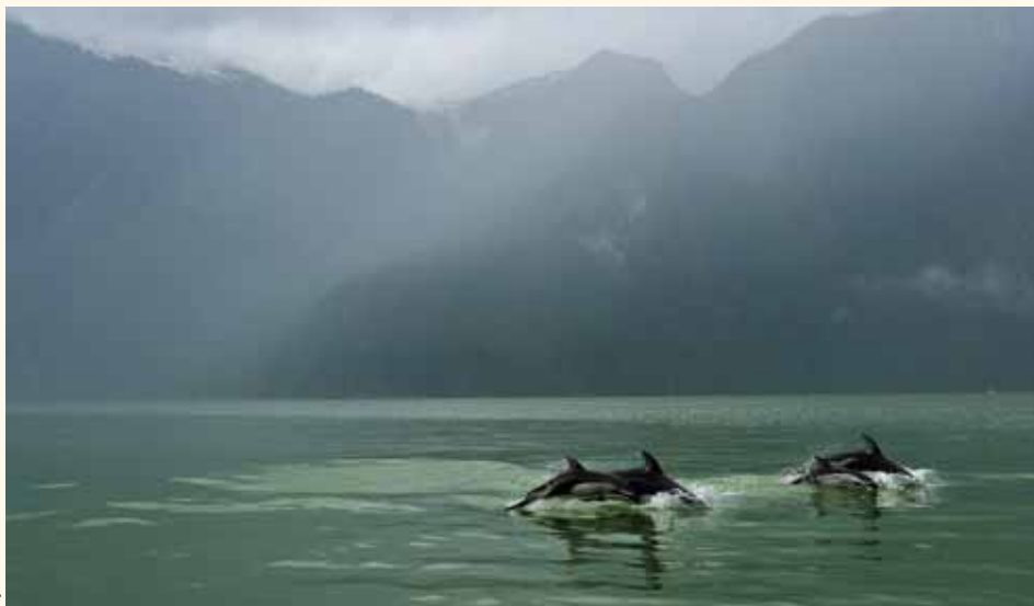
Magical Knight Inlet