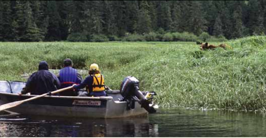
Bear viewing