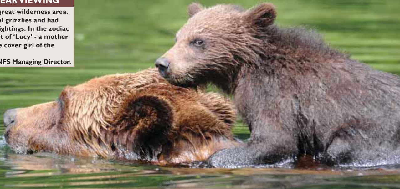
Khutzeymateen - Hitching a ride