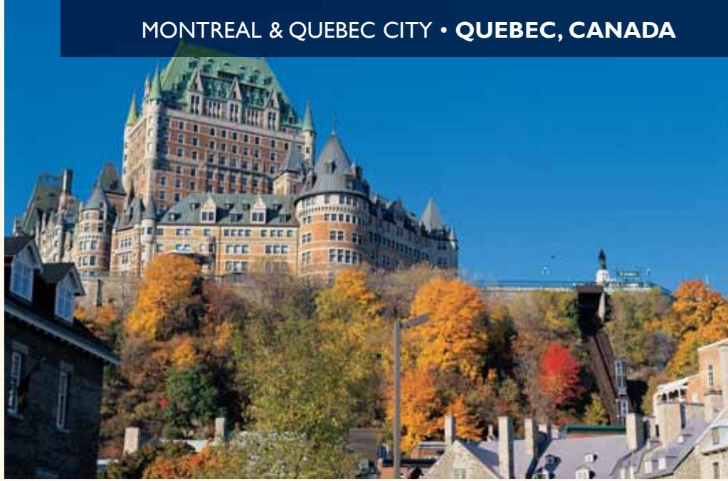
Fairmont Le Chateau Frontenac