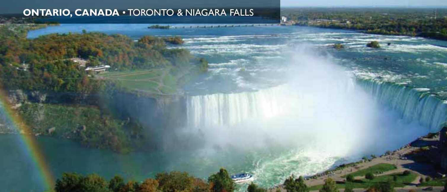
"Maid of the Mist" - Niagara Falls

ONTARIO From sensational scenery to great cities Ontario is the home of Canada's capital, Ottawa, its largest city, Toronto, and the famous Niagara Falls. In the south it borders the spectacular Great Lakes and in the north the arctic regions of Hudson Bay. Below is just a brief glimpse of the many tours we have available.