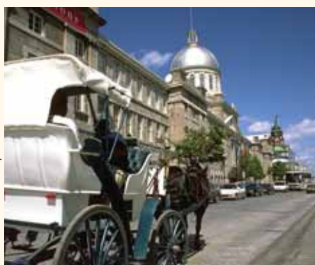
Horse & Buggy Ride, Montreal

Note: This tour can easily be extended or modified.