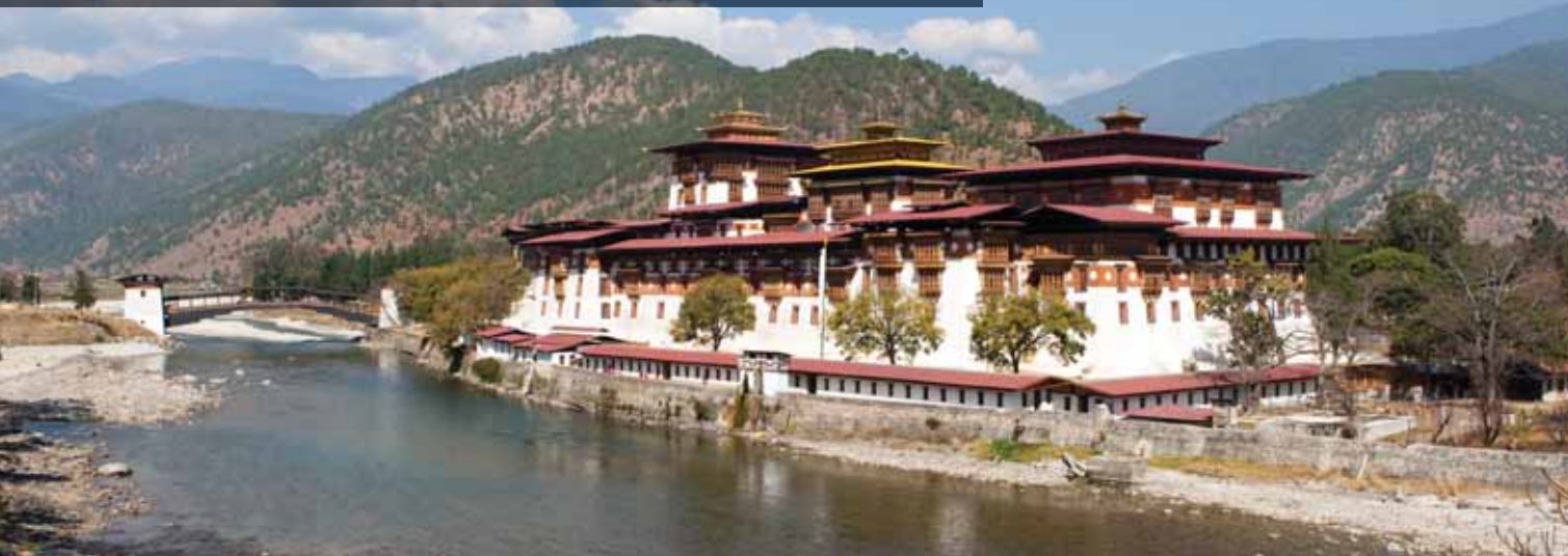
Spectacular Punakha Dzong