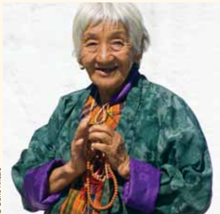
Pilgrim at the National Memorial Chorten

Early flight to Paro. Visit the Ta Dzong Museum and the 17th century Rimping Dzong before driving onto Bhutan's capital, Thimphu (2 hrs). LD