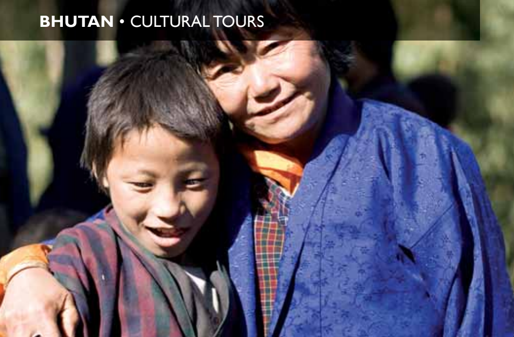
Bhutan family portrait