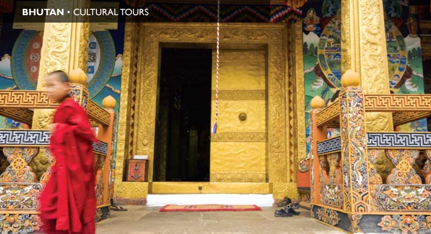
Monks leaving the main hall of Punakha Dzong