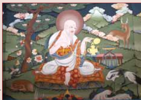
Wall painting, Punakha Dzong

Early morning transfer to airport for your onward flight. Tour ends. B