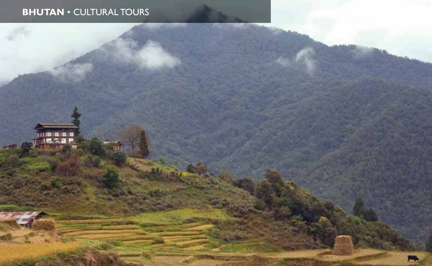
Beautiful Punakha