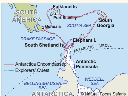
Shackleton hike, Falkland Islands