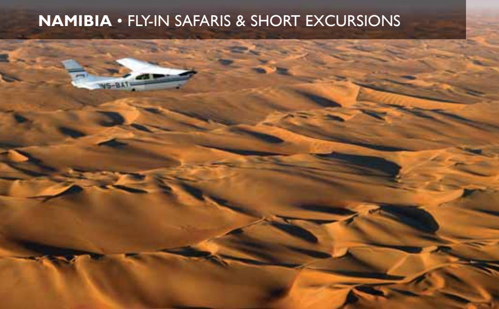
Namibia's spectacular scenery