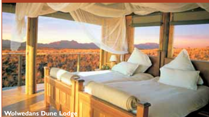
Wolwedans Dune Lodge

Nestled amongst sand dunes in the NamibRand private concession, Wolwedans offers 3 very individual properties: Boulders Camp is the most exclusive, with just 4 luxury tents hugged by granite rocks, overlooking ancient bushman hunting grounds; Dune Lodge with 9 open-sided chalets and desert panoramas; and Dune Camp with 6 raised canvas tents, providing a very civilised camping experience. Treks, scenic drives and sleep outs afford the opportunity to discover the beauty of the desert.