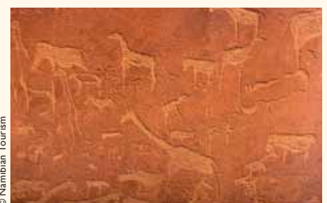
Twyfelfontein rock paintings

Drive back to Windhoek, returning your hire car before your onward flight.