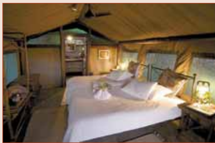
Ongava Tented Camp