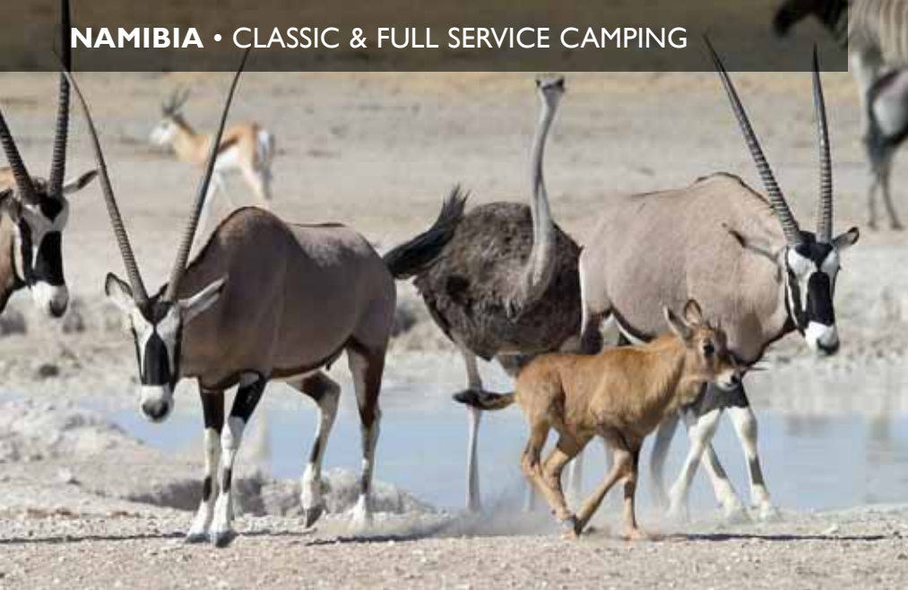
Action at an Etosha waterhole