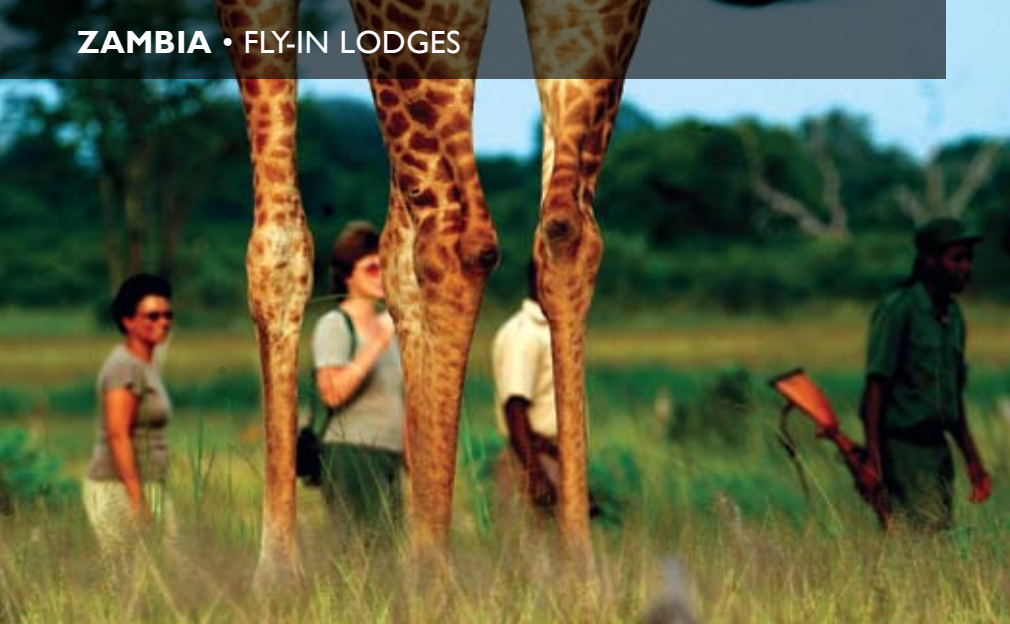
Walking safaris put you in the picture