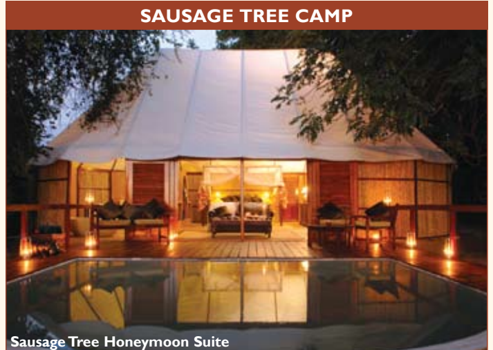
Sausage Tree Honeymoon Suite

Exclusive Sausage Tree Camp and Kigelia House are set in idyllic locations on the Zambezi River. Luxury Sausage Tree accommodates 16 guests in Bedouin-style tents with ensuite bathrooms. Private Kigelia House has two large ensuite bedrooms suitable for small groups. The main lounge and dining area feature a large viewing platform for guests to soak up panoramas of the game-rich floodplain. Children: Sausage Tree 12+, Kigelia 8+.