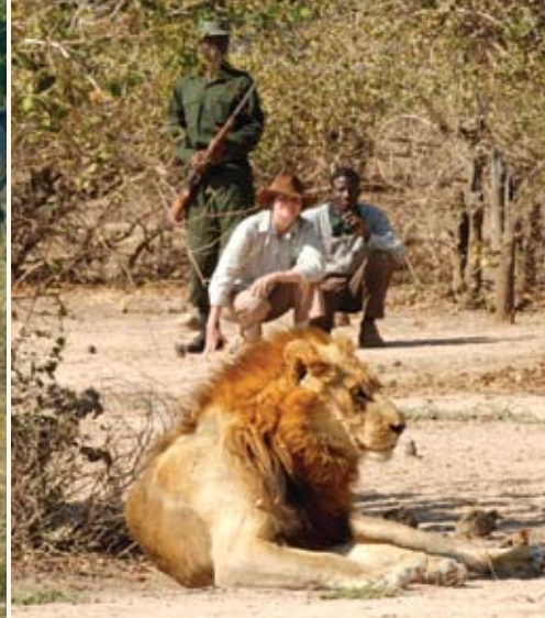
Close encounter with a King