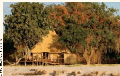
Nsolo Bush Camp

Situated on a waterhole just 3 hours walk from Luwi Bush Camp, Nsolo has 4 rustic, open-fronted rooms, built on raised wooden platforms under a thatched roofs with bathrooms open to the stars above. There is an alfresco dining area and bar.