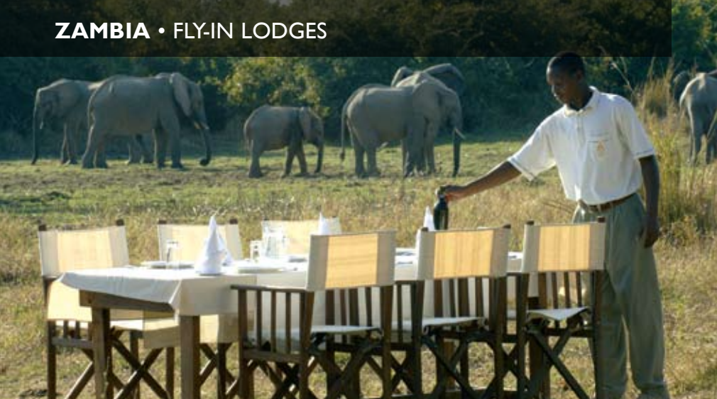
Dining with friends