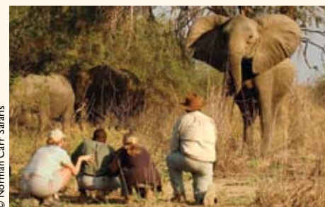
Incredible walking safari experience