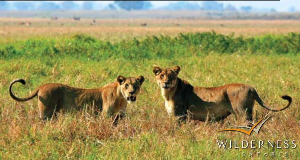
On the lookout - Busanga Plains