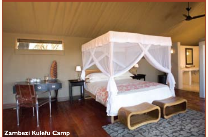
Zambezi Kulefu Camp

Located by a permanent waterway, Kulefu has all the hallmarks of a Sanctuary Retreats property, five star service and quality cuisine. The camp comprises 7 spacious ensuite canvas tents surrounding a pool, dining and lounge area; lit only by paraffin lamps and a roaring campfire after dark. Explore the park by vehicle, on foot (with an armed ranger), by boat or canoe.